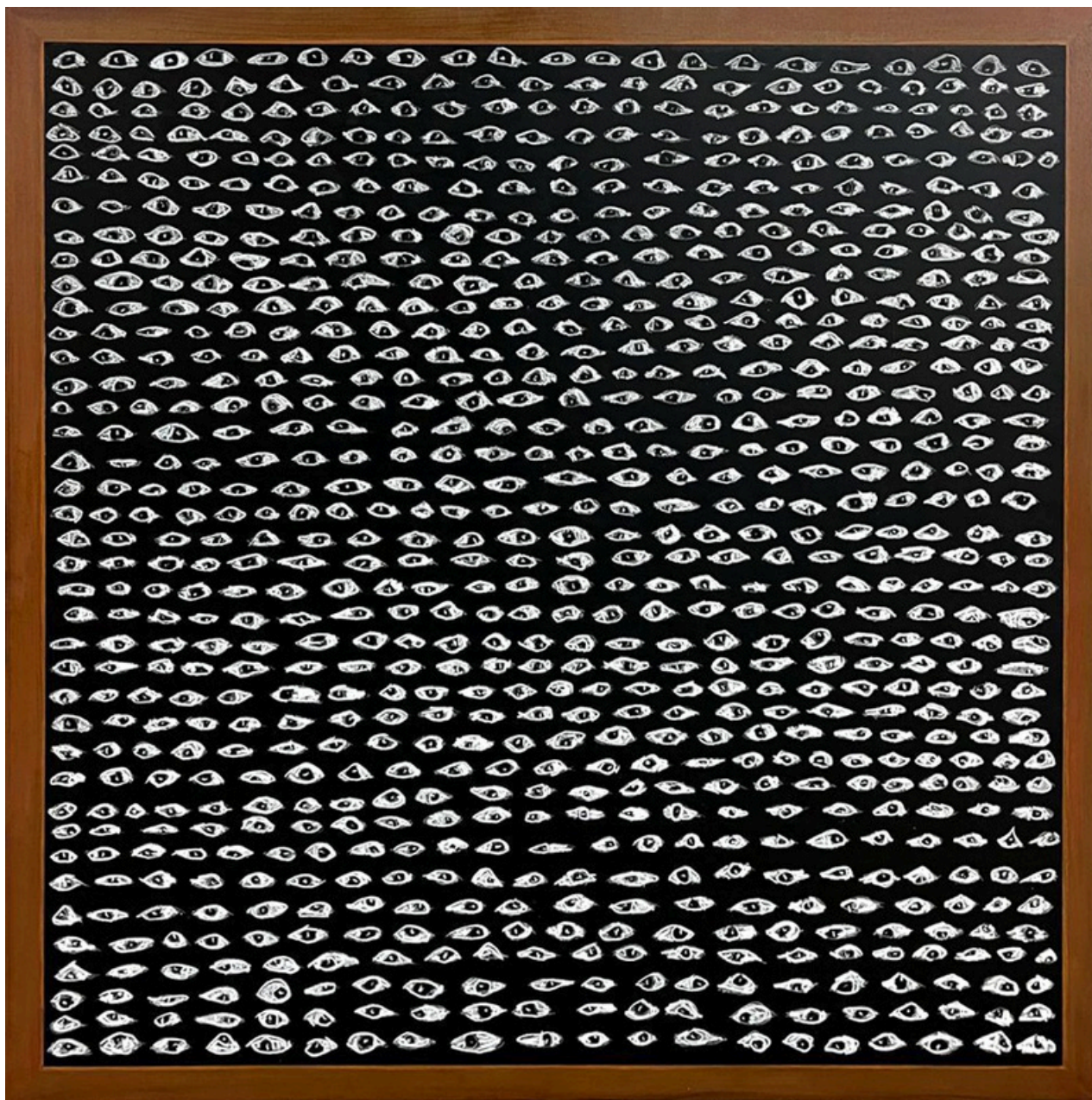
Davide Mancini Zanchi, Una cosa divertente che non farò mai più, 2024, Acrylic on canvas, 160x160 cm