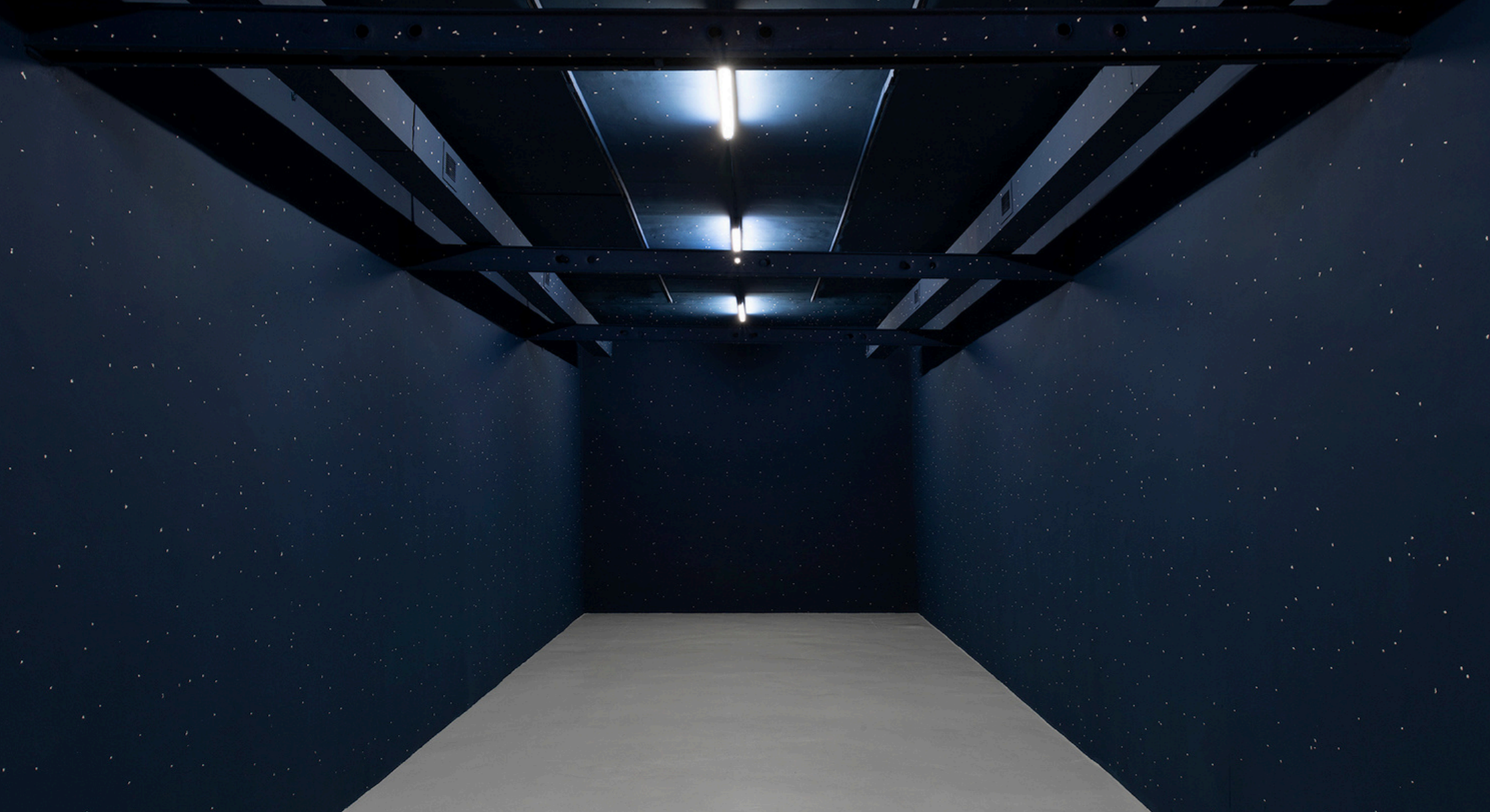
Exhibition view “No Diamonds in the sky”, Fondazione Pastificio Cerere, Roma, 2023