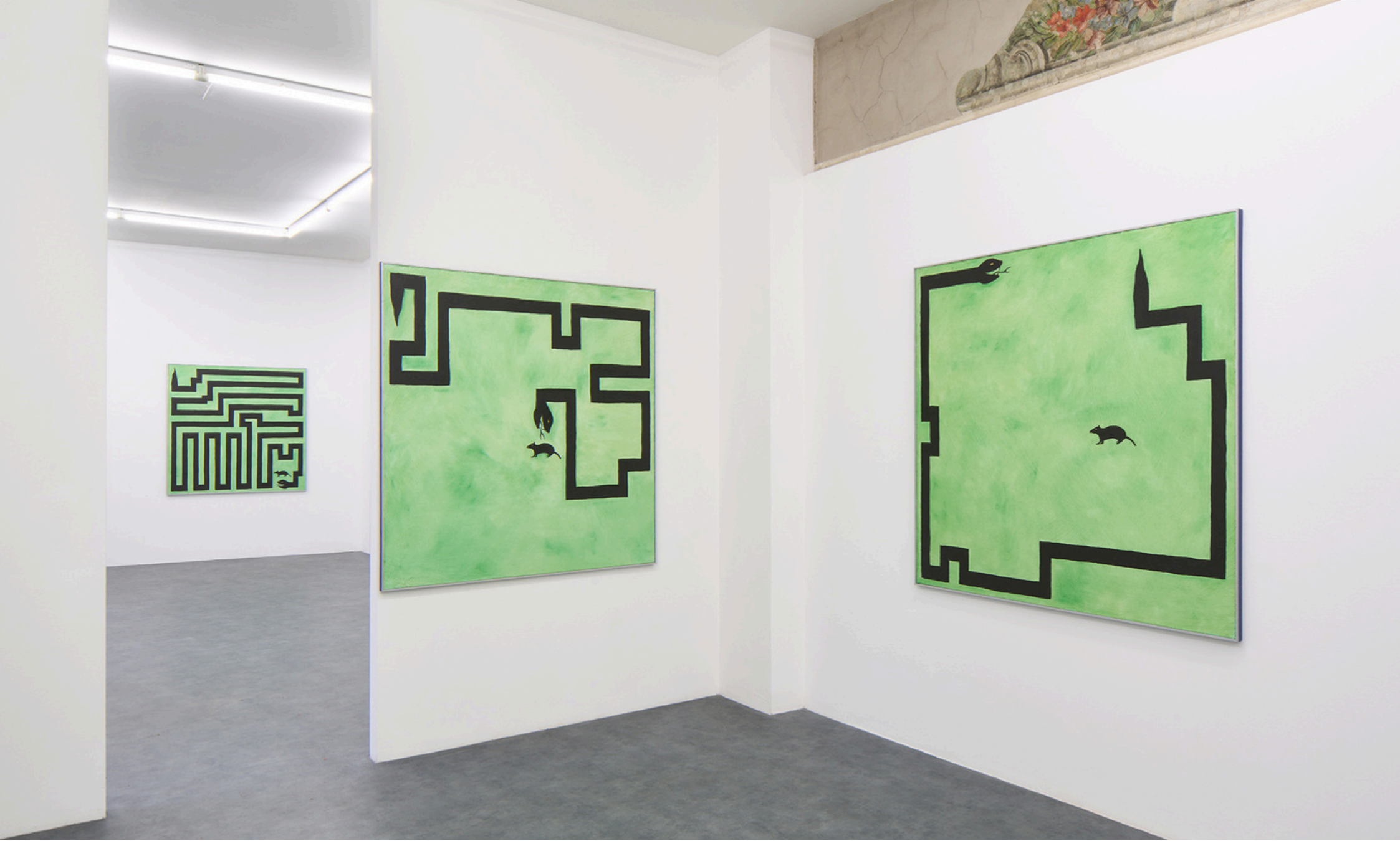
Exhibition view "Domenica", A+B Gallery, Brescia, 2022