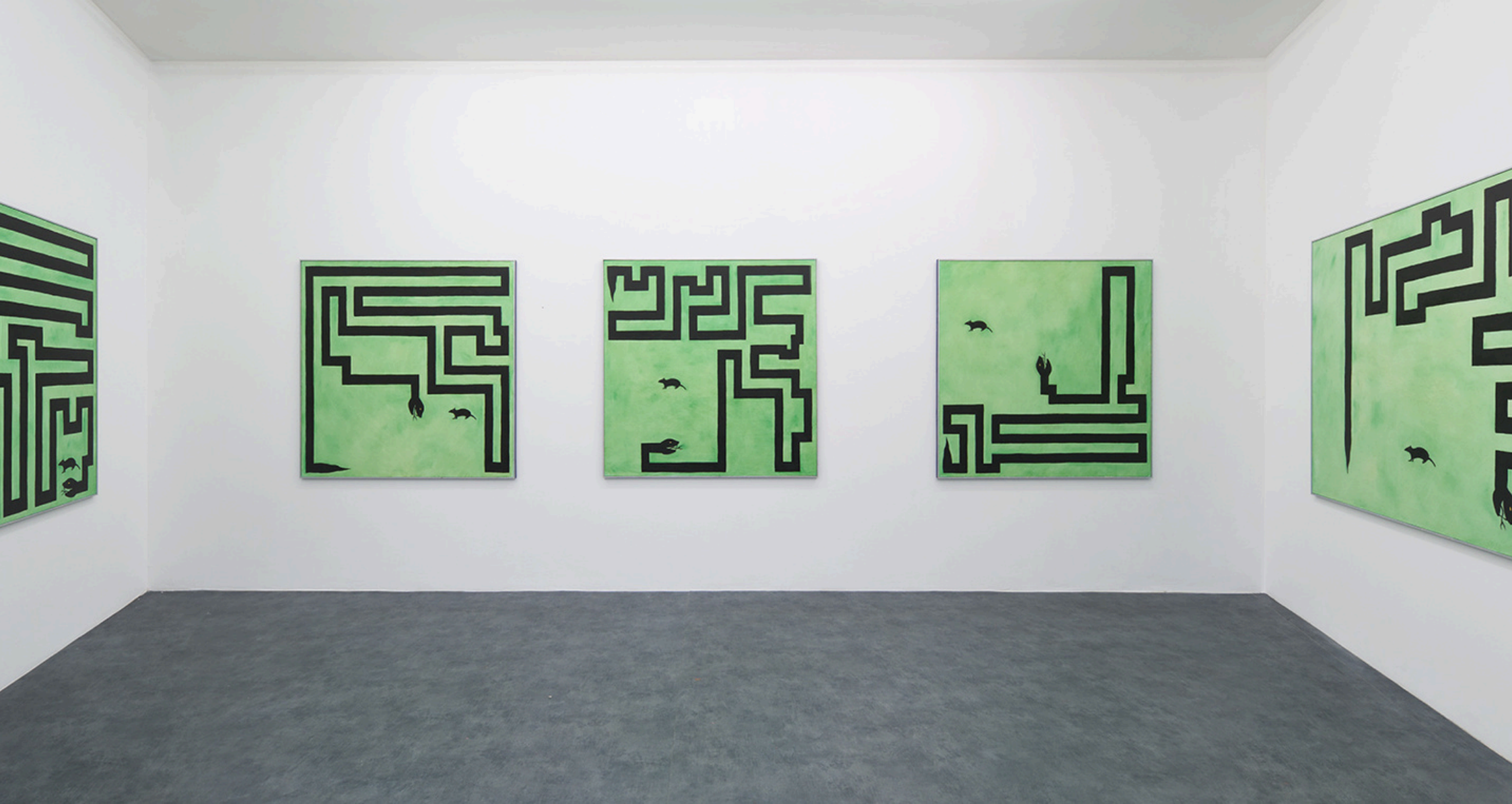
Exhibition view "Domenica", A+B Gallery, Brescia, 2022