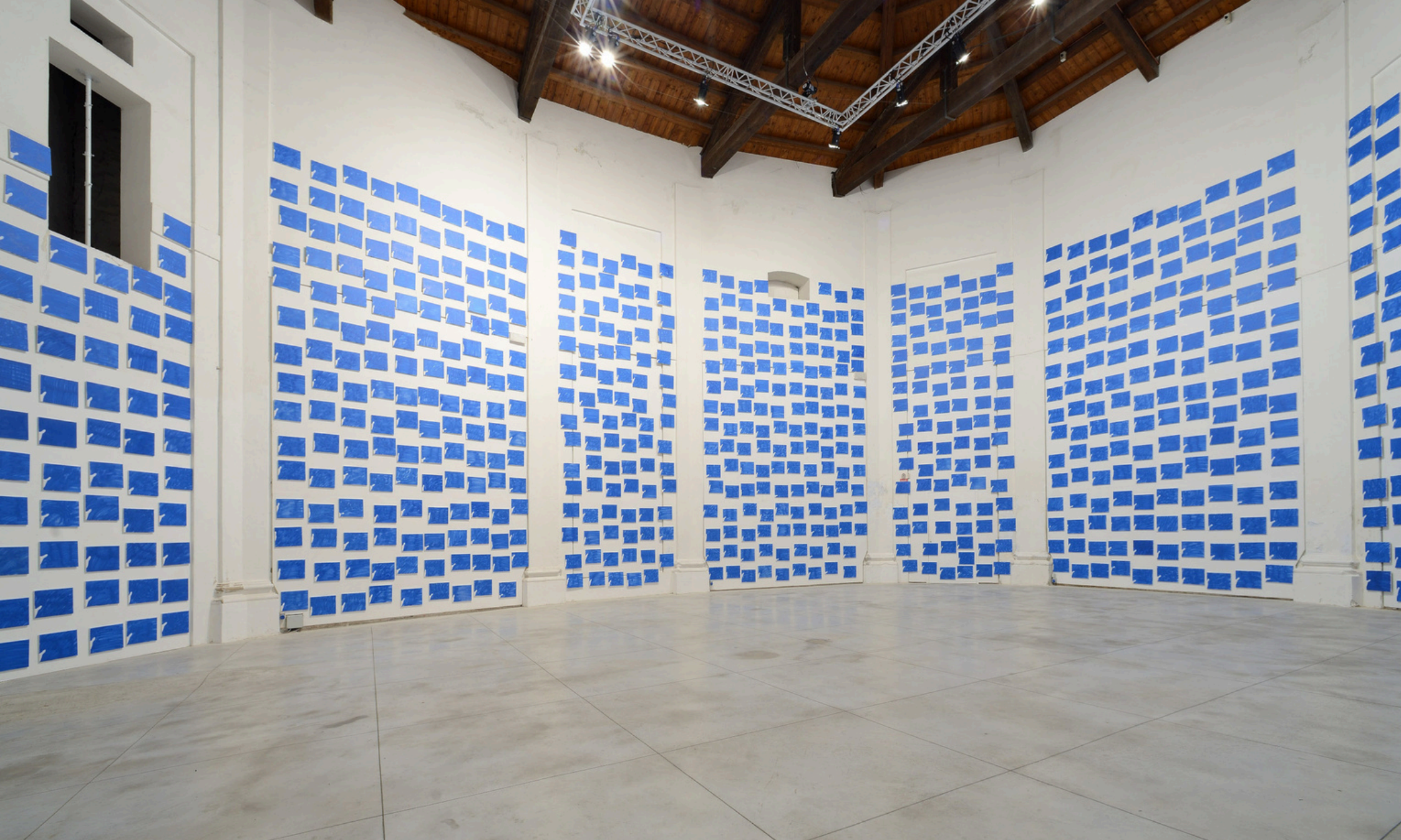
Exhibition view “Mira il mare ma le”, Centro arti visive Pescheria, Pesaro, 2021