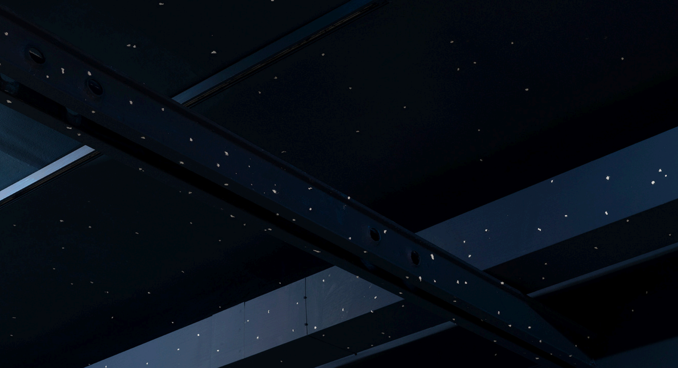
Exhibition view “No Diamonds in the sky”, Fondazione Pastificio Cerere, Roma, 2023