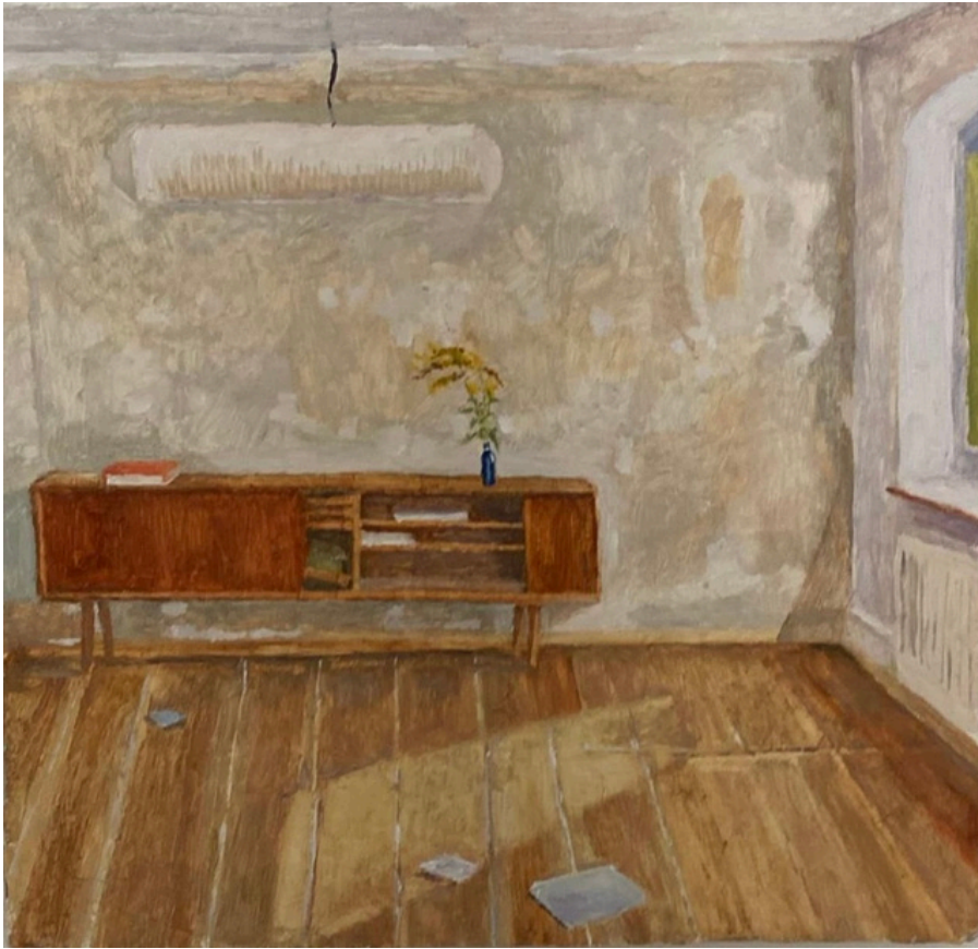
Flora Temnouche A new living room 2024, oil on canvas, 30x29,5cm € 2.000 vat. incl.