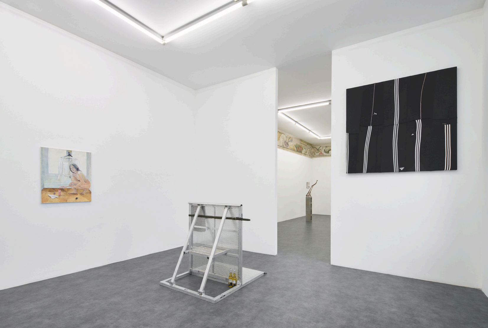
Group exhibition Warm, physicist as atmosphere and sensorial trace. With Flora Temnouche, A+B Gallery, Brescia.