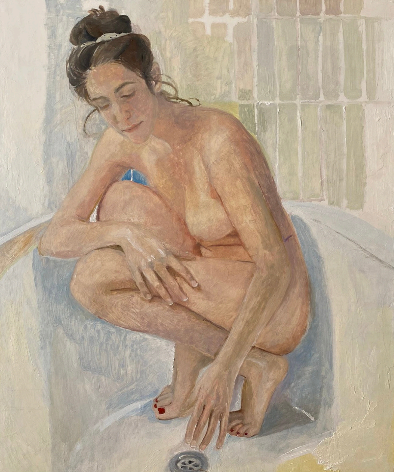
Flora Temnouche Bath 2024, oil on canvas, 80x65 cm € 4.200 vat. incl.