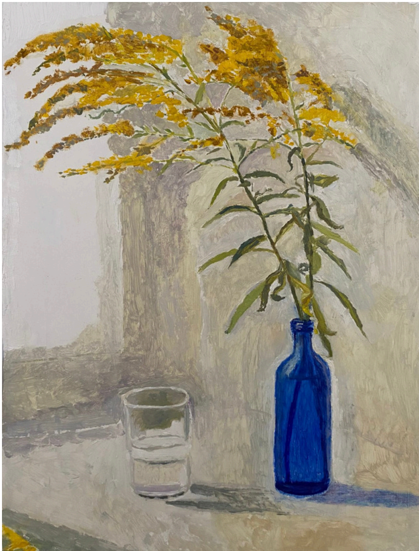
Flora Temnouche Summer 2024, oil on canvas, 30x40 cm € 2.000 vat. incl.