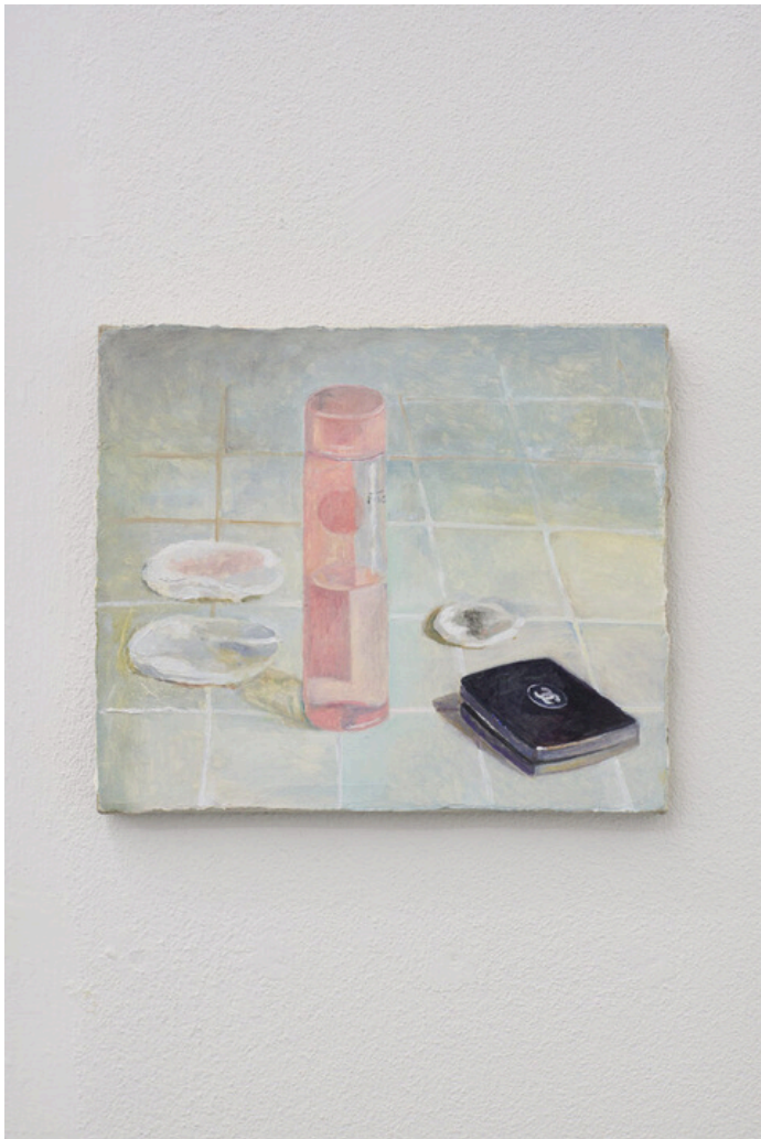
Flora Temnouche Still life 2024, oil on canvas, 30x35 cm € 2.000 vat. incl.