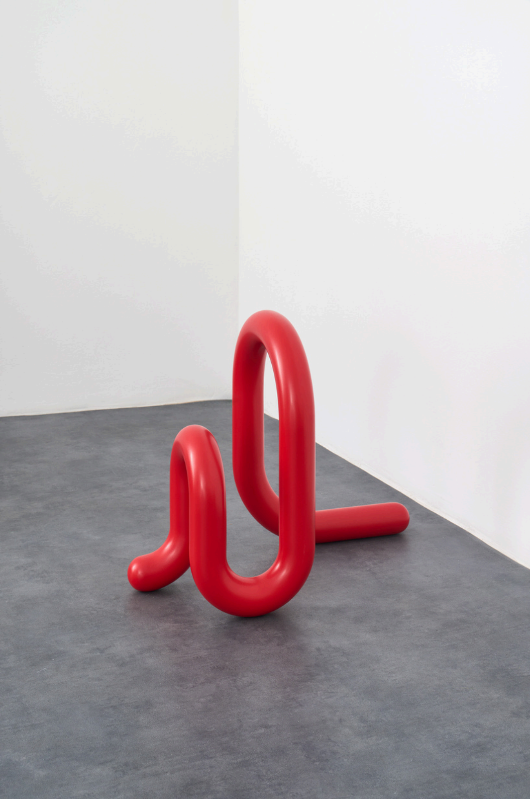
Tobias Hoffkencht Forward 2024 Varnished steel 44 x 72 x 64h cm € 6.500