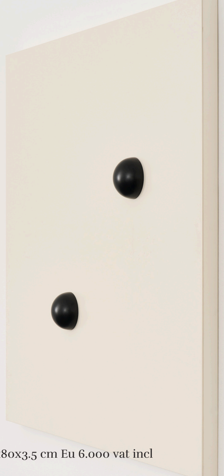
Tobias Hoffknecht, Laughter and applause, 2024, steel, varnish, wood, 80x80x3.5 cm Eu 6.000 vat incl