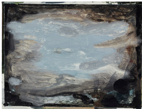
Nazzarena Poli Maramotti, Un cielo che torna sereno 2024, (framed) oil on paper, 19x25 cm € 1,400 vat. incl.