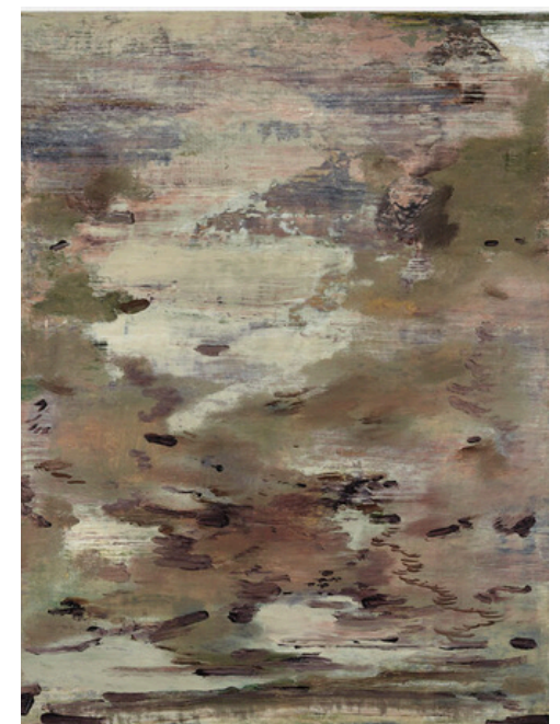
Nazzarena Poli Maramotti, Tutto viene dal niente 2024, (framed) oil on paper, 26x20 cm € 1,400 vat. incl.