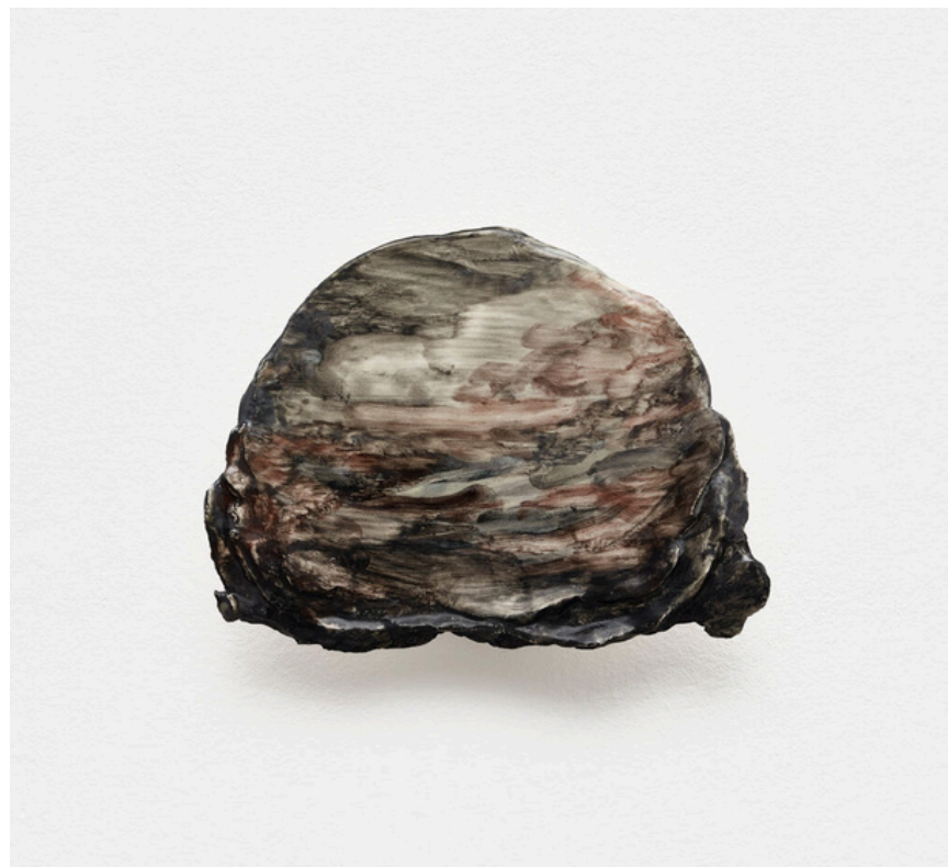
Nazzarena Poli Maramotti, L'autunno dentro 2024, glazed ceramic 17,5x24 cm € 1,500 vat. incl.