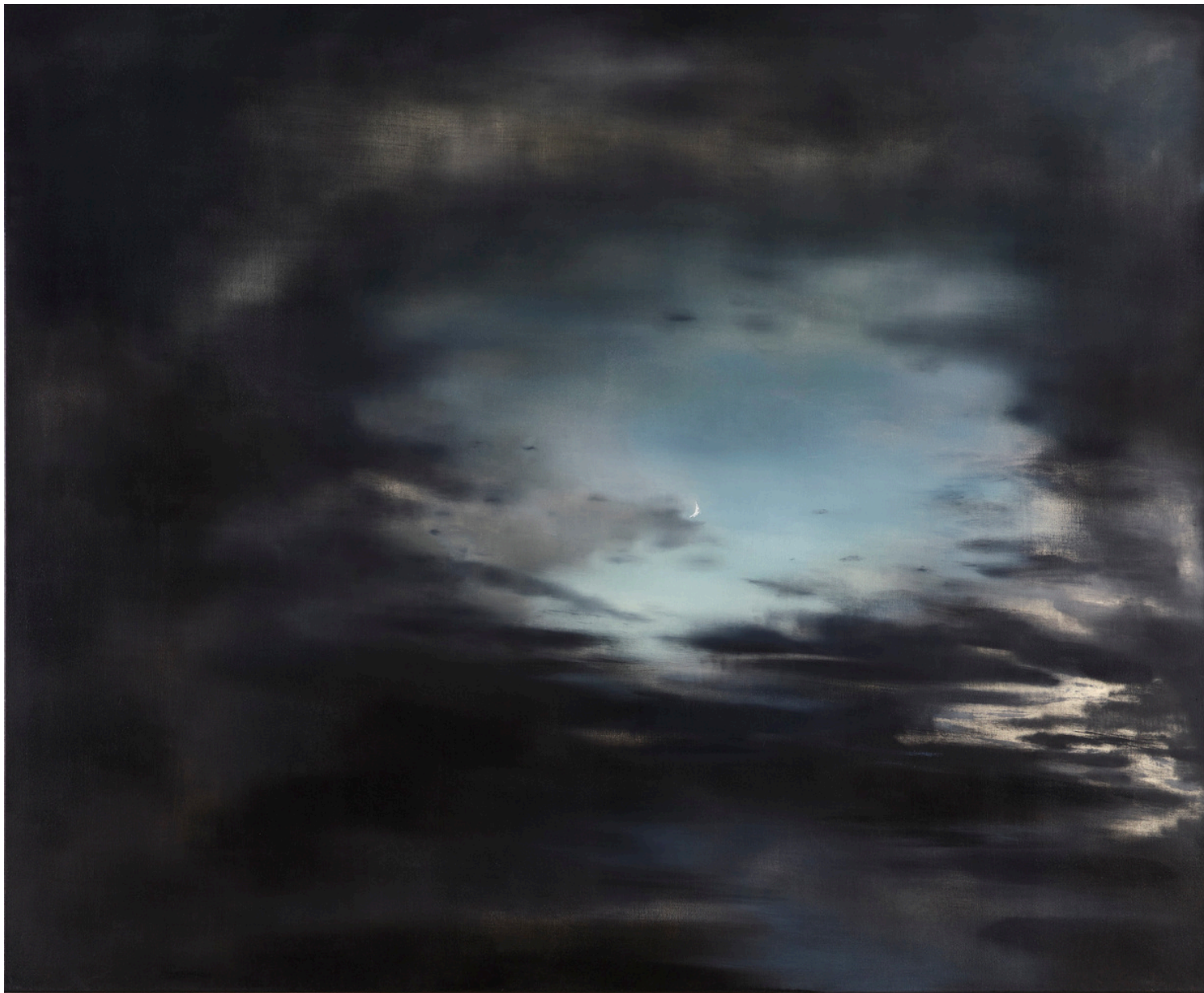
Nazzarena Poli Maramotti, La pace (il cielo è in terra), 2024, Mixed media on canvas, 140x170 cm € 8.200 vat. incl.