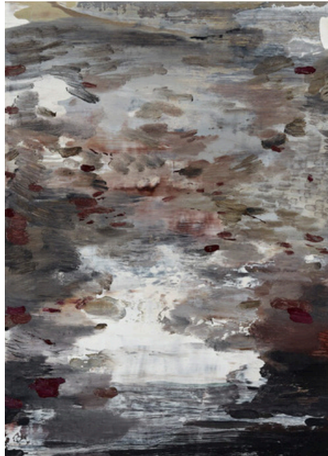
Nazzarena Poli Maramotti, Vecchi soli, nuove prospettive 2024, (framed) oil on paper, 24x17 cm € 1,400 vat. incl.