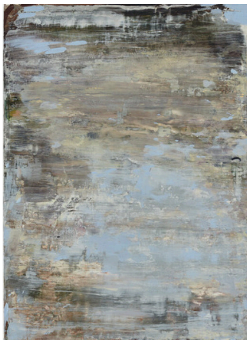
Nazzarena Poli Maramotti, Acque calme 2024, (framed) oil on paper, 29x21 cm € 1,400 vat. incl.