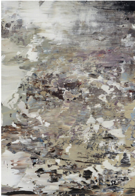
Nazzarena Poli Maramotti, Coro di sirene, 2024, (framed) oil on paper, 25x18 cm € 1,400 vat. incl.