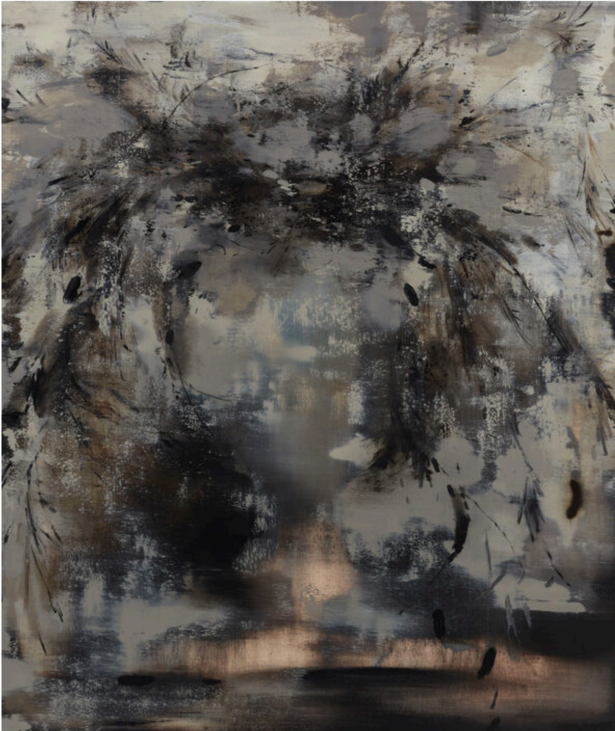
Nazzarena Poli Maramotti, In frantumi, 2024, Mixed media on canvas, 120X100 cm € 6,000 vat. incl.