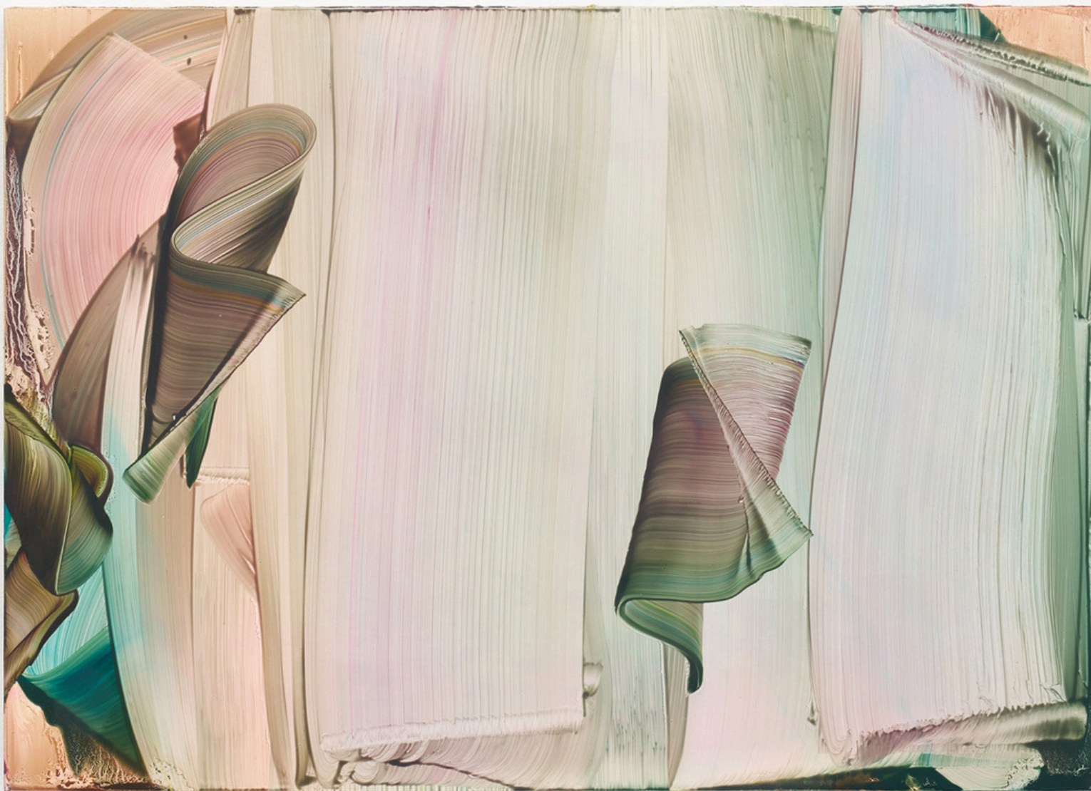
Markus Saile Untitled, 2023, Oil on wood, cm 63x88 cm Eu 10.000 vat incl