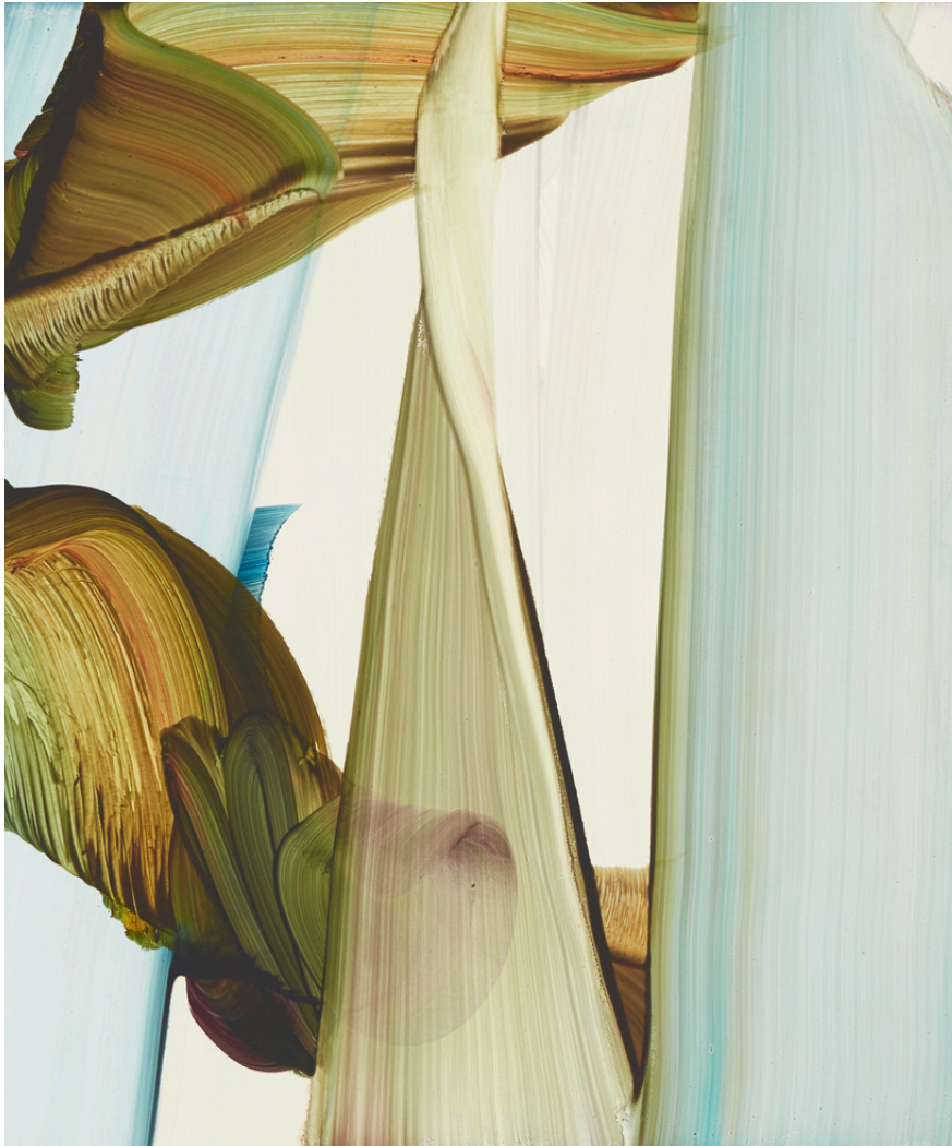
Markus Saile Untitled, 2024, Oil on wood, 49x41 cm Eu 6.200 vat incl