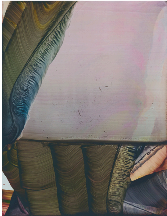
Markus Saile Untitled, 2024, Oil on wood, 17x13 cm Eu 3,200 vat incl