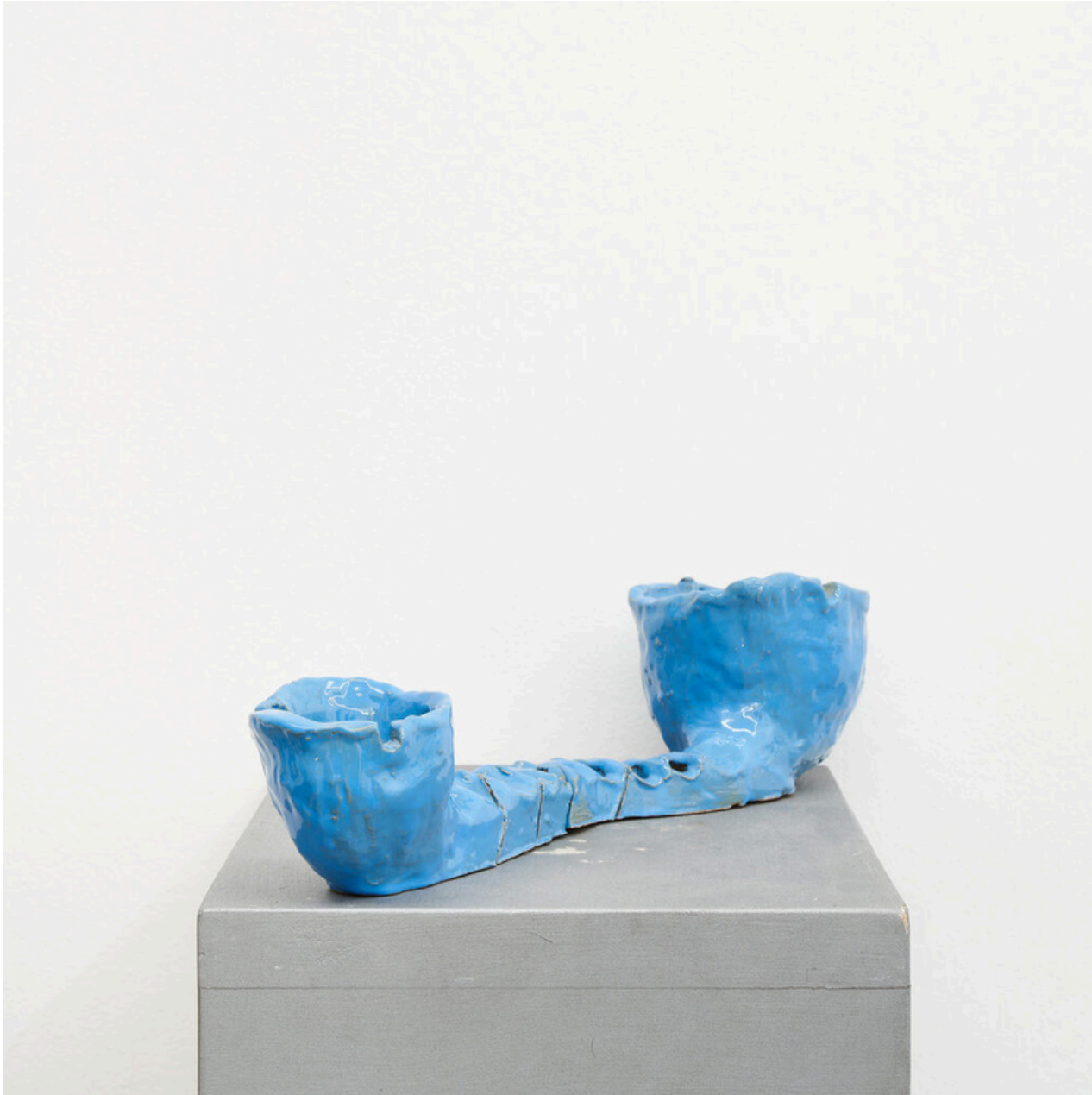
Davide Mancini Zanchi, Posacenere #3, 2020, glazed ceramic 11x30x10 cm € 2,000 vat. incl.