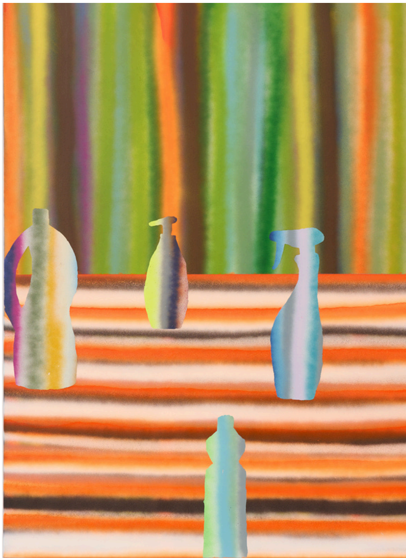
Davide Mancini Zanchi, Natura morta n.10 2024, Acrylic on canvas, 120x90 cm € 4,500 vat. incl.