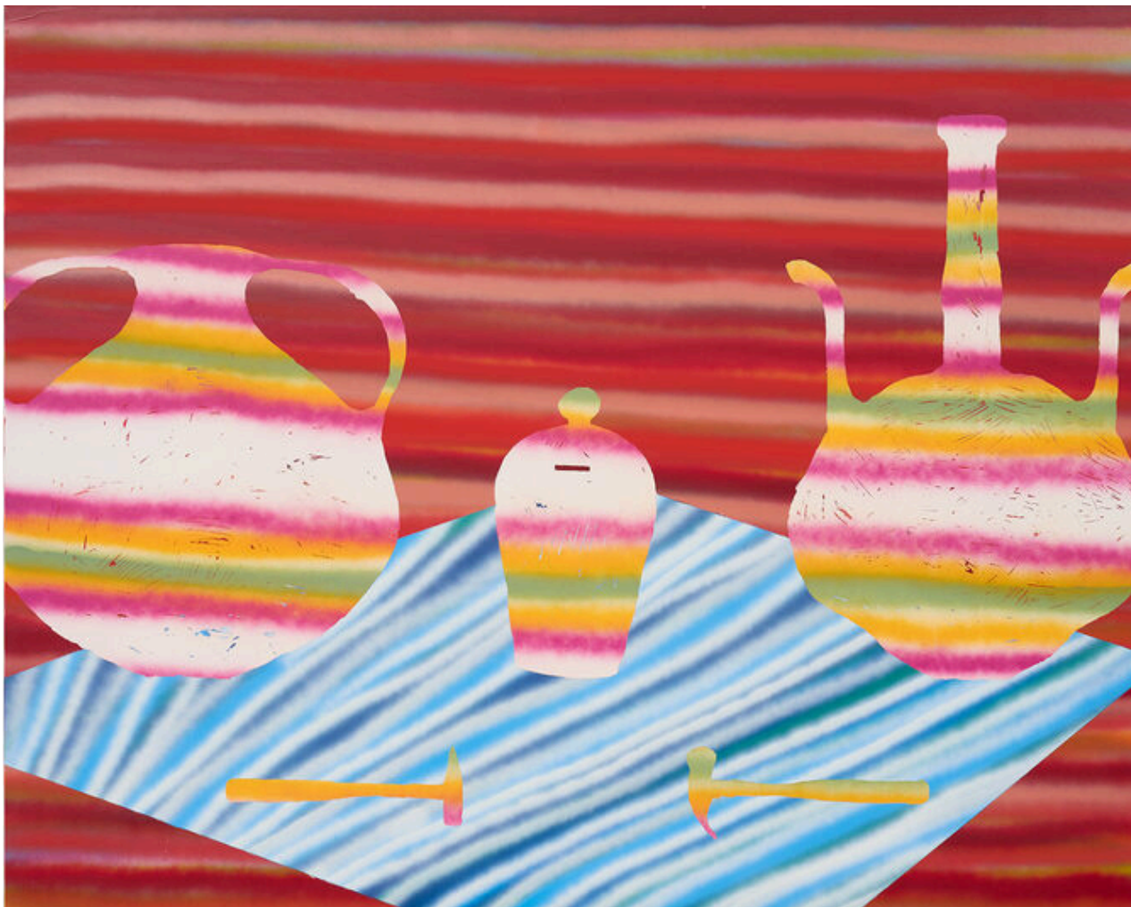
Davide Mancini Zanchi, Natura morta n.13, 2024, Acrylic on canvas, 120x150 cm € 6,000 vat. incl.