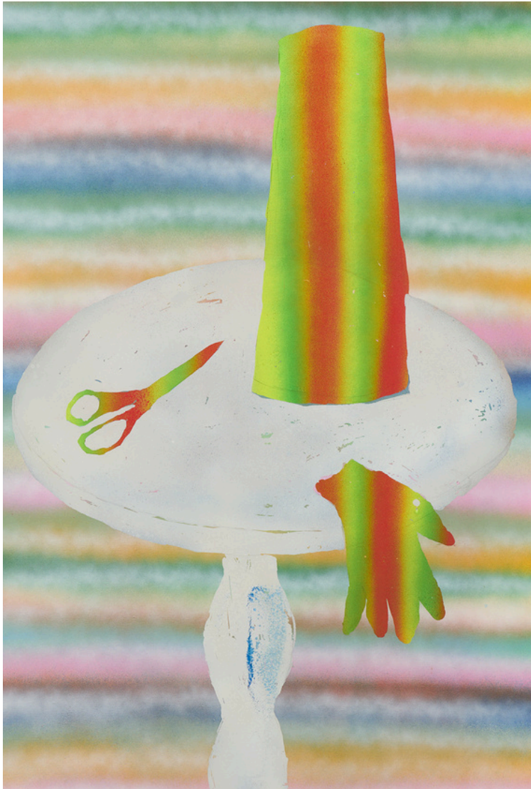
Davide Mancini Zanchi, Natura morta n.5, 2024, Acrylic on canvas, 100x70 cm € 3,500 vat. incl.