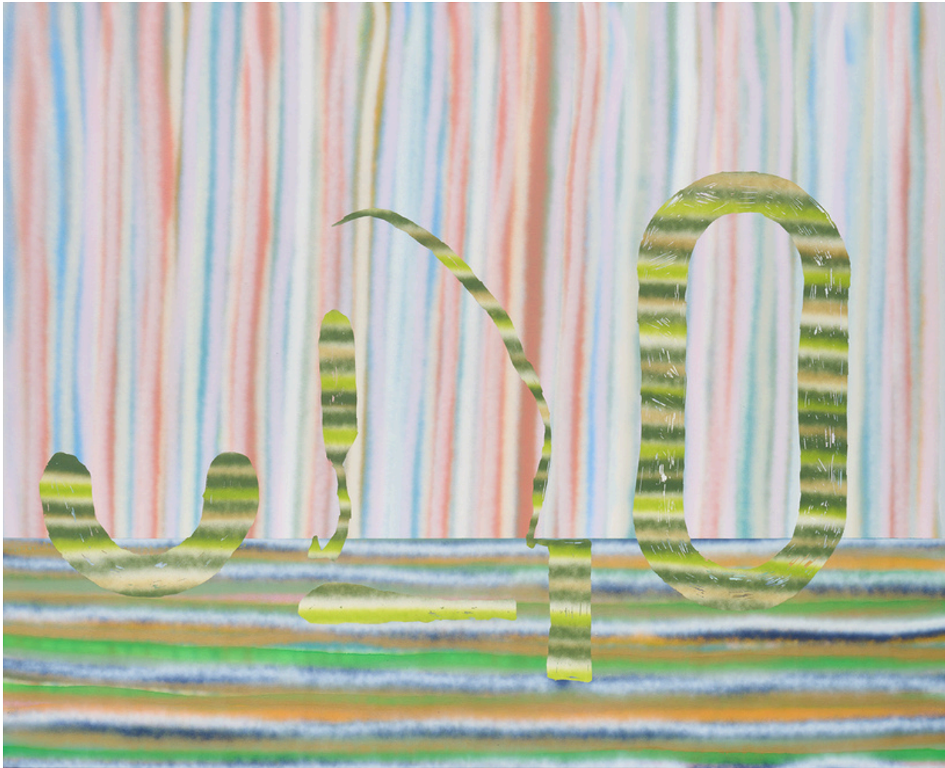
Davide Mancini Zanchi, Natura morta n.14, 2024, Acrylic on canvas, 120x150 cm € 6,000 vat. incl.