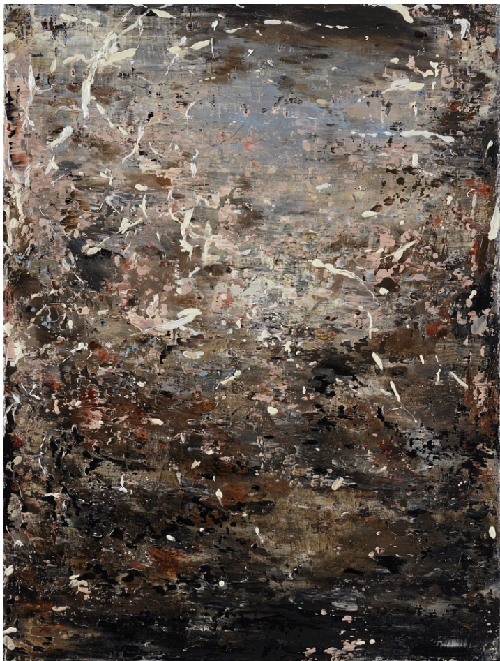
Nazzarena Poli Maramotti, La dispersione, 2023, Mixed media on canvas, 40x30 cm € 2,000 vat. incl.