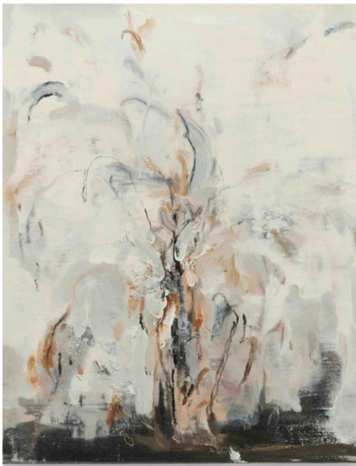
Nazzarena Poli Maramotti, Vaso di fiori, 2020, Mixed media on canvas, 50x40 cm € 2,500 vat. incl.