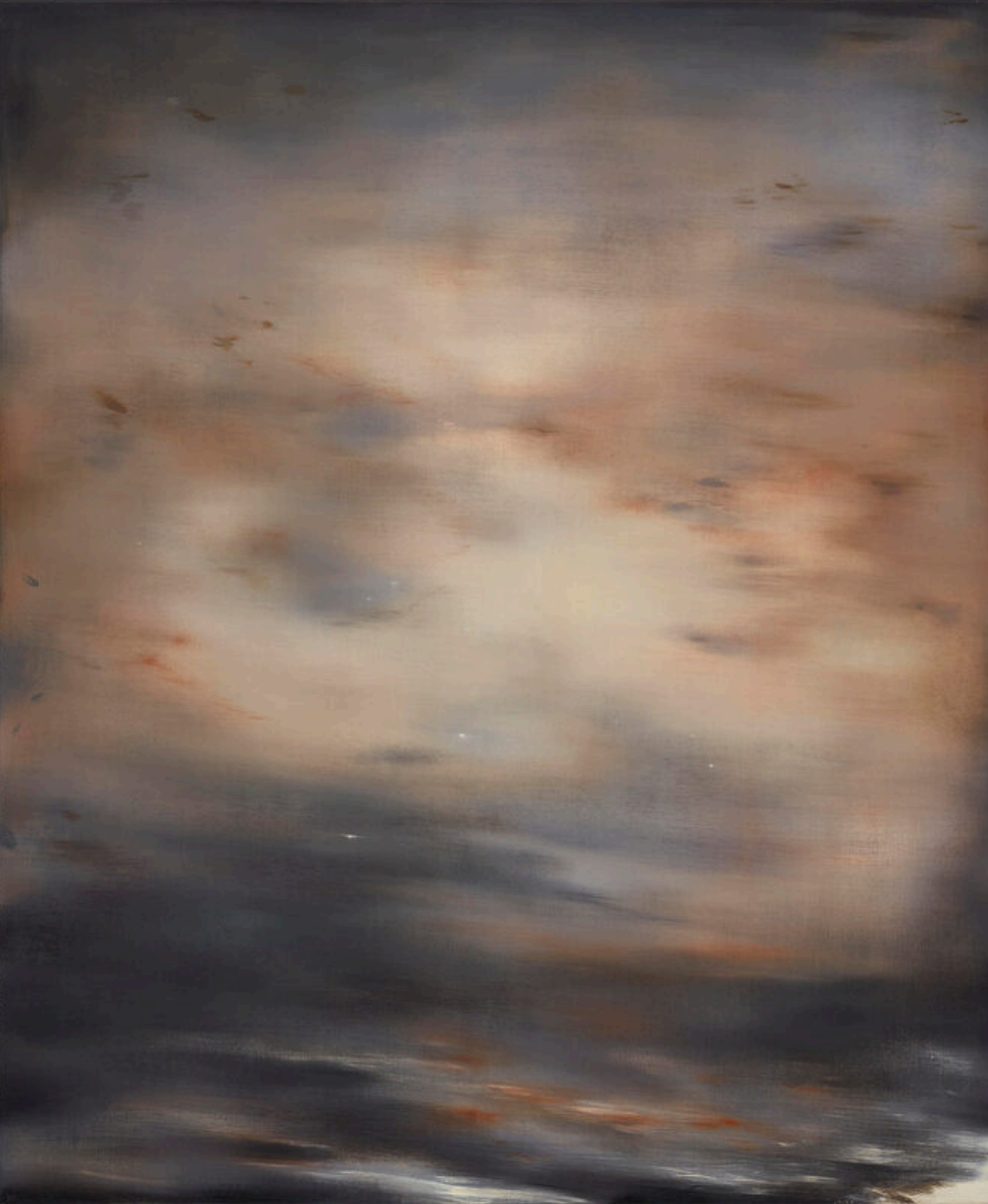
Nazzarena Poli Maramotti, Ci passiamo tutti, 2024, Mixed media on canvas, 120X100 cm € 6,000 vat. incl.