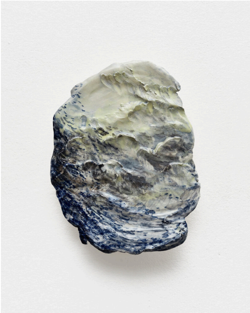
Nazzarena Poli Maramotti, L'onda 2024, glazed ceramic 25x20 € 2,300 vat. incl.