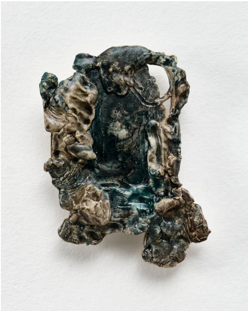
Nazzarena Poli Maramotti, Il sereno, il lago 2023, glazed ceramic 31x24 cm € 2,500 vat. incl.