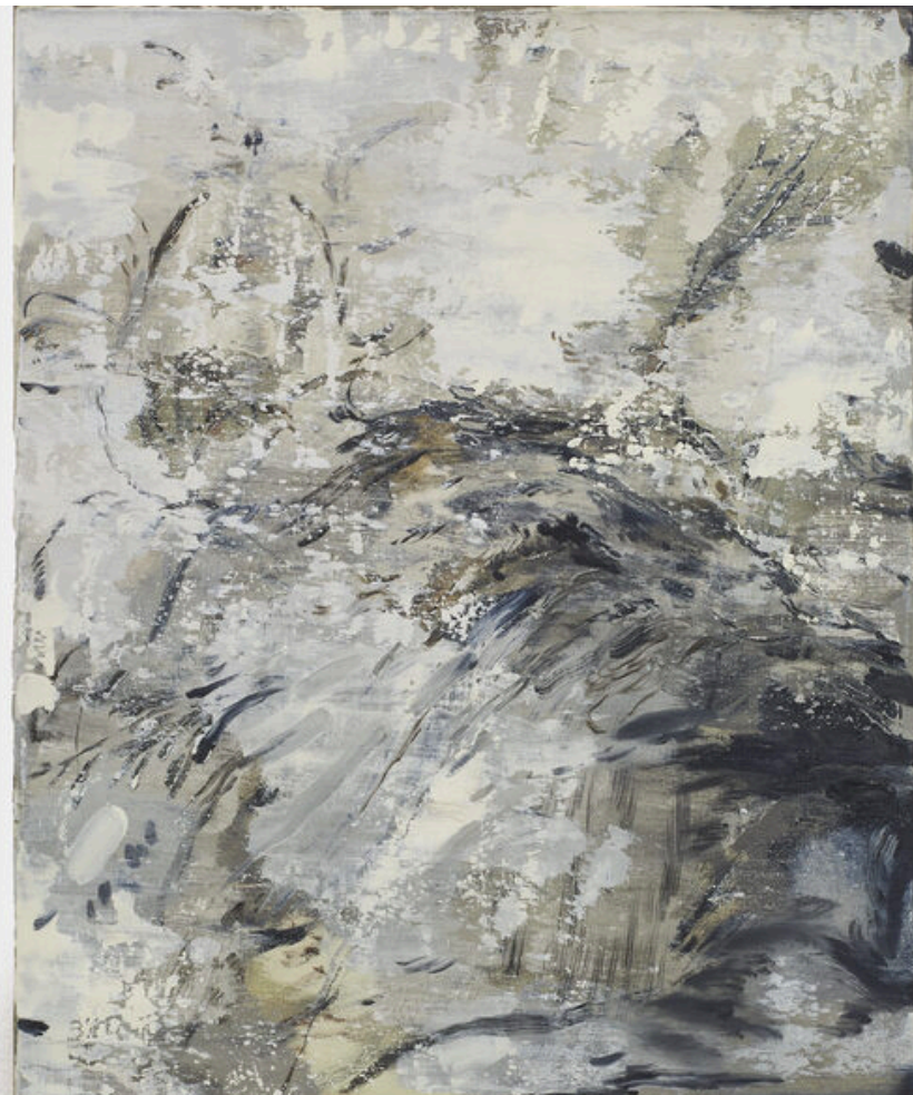
Nazzarena Poli Maramotti, Frasche 2023, Mixed media on canvas, 50x40 cm € 2,500 vat. incl.