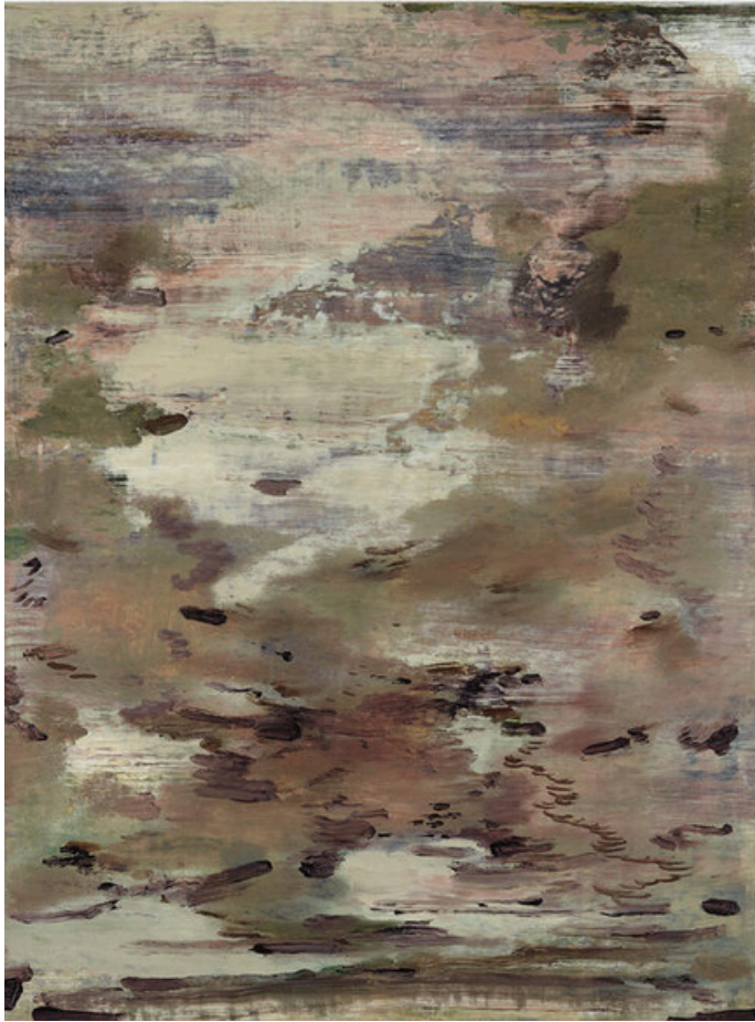
Nazzarena Poli Maramotti, Tutto viene dal niente 2024, oil on paper, 26x20 cm € 1,400 vat. incl.