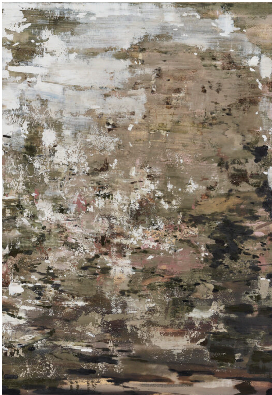
Nazzarena Poli Maramotti, Il tempo 2024, Mixed media on canvas, 100x70 cm € 4,500 vat. incl.