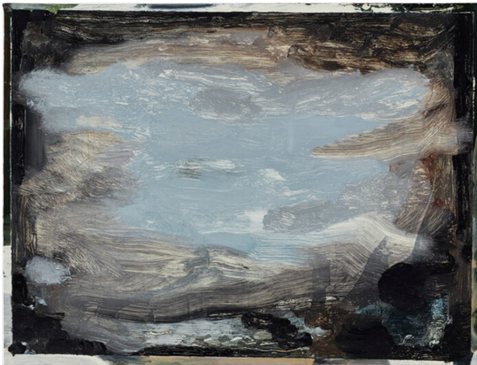
Nazzarena Poli Maramotti, Un cielo che torna sereno 2024, oil on paper, 19x25 cm € 1,400 vat. incl.