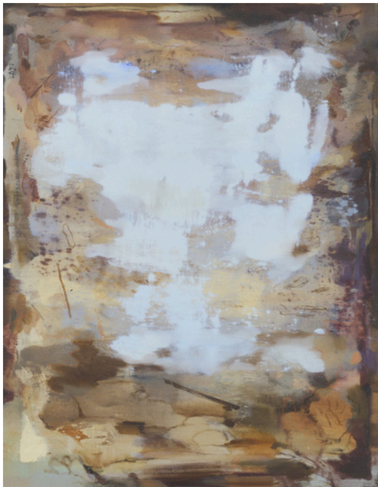
Nazzarena Poli Maramotti, Sturm 2019, Mixed media on canvas, 65x40 cm € 3,000 vat. incl.