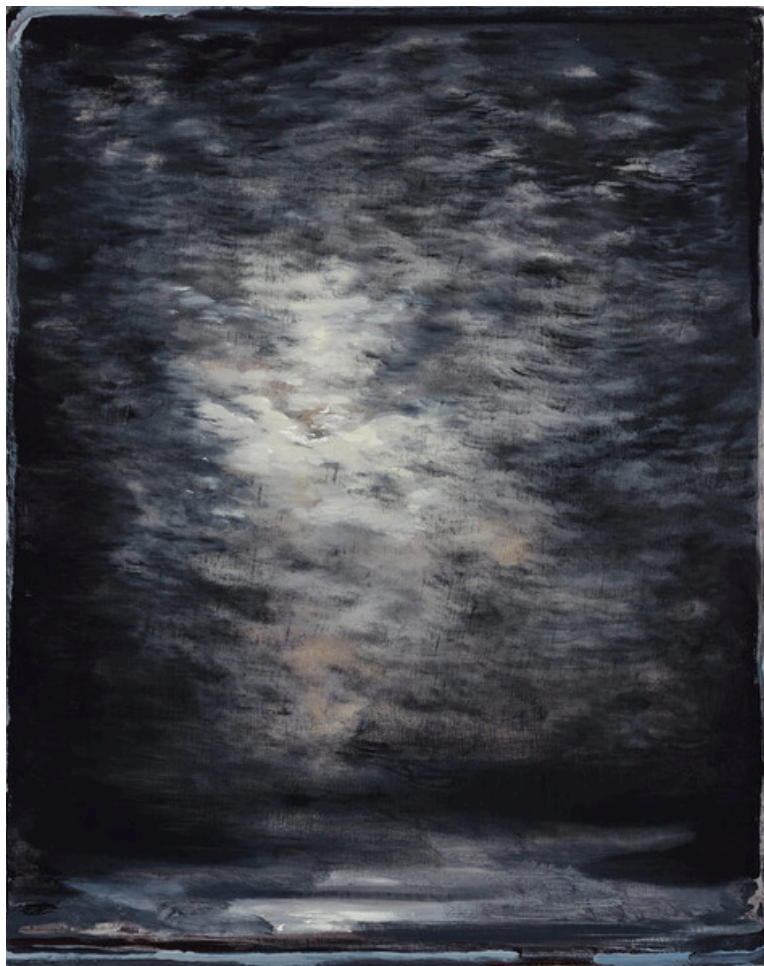
Nazzarena Poli Maramotti, Il lago alle falde del monte evapora, 2024, Mixed media on canvas, 50x40 cm € 2,500 vat. incl.