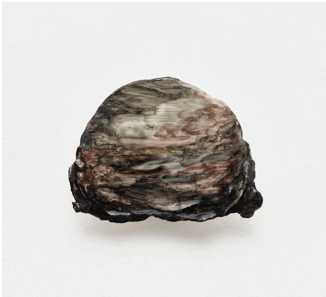
Nazzarena Poli Maramotti, L'autunno dentro 2024, glazed ceramic 17,5x24 cm € 1,500 vat. incl.