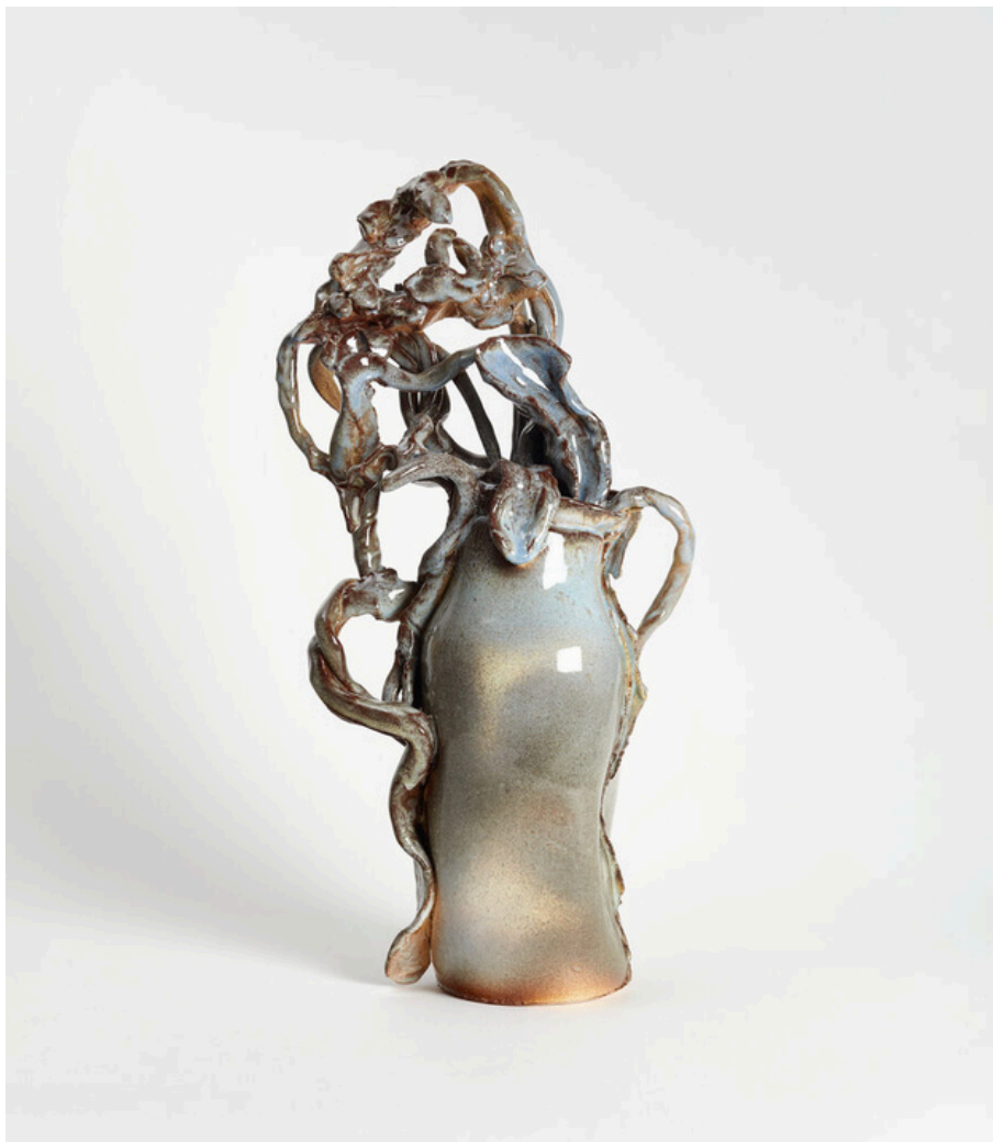
Nazzarena Poli Maramotti, Vaso lunare, 2023, glazed ceramic 38×18×10 cm € 3,200 vat. incl.