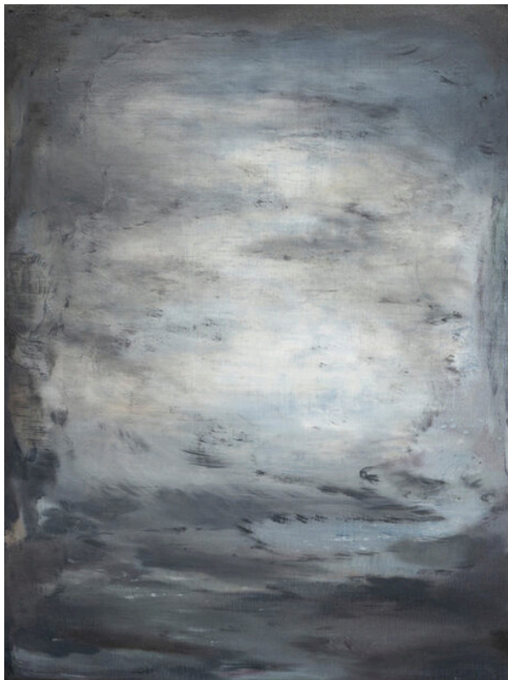
Nazzarena Poli Maramotti, Qualcosa di epico 2022, Mixed media on wood, 40x30 cm € 2,000 vat. incl.