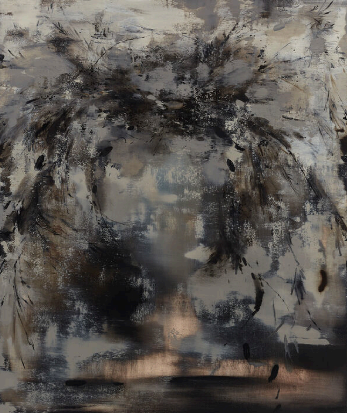
Nazzarena Poli Maramotti, In frantumi, 2024, Mixed media on canvas, 120X100 cm € 6,000 vat. incl.