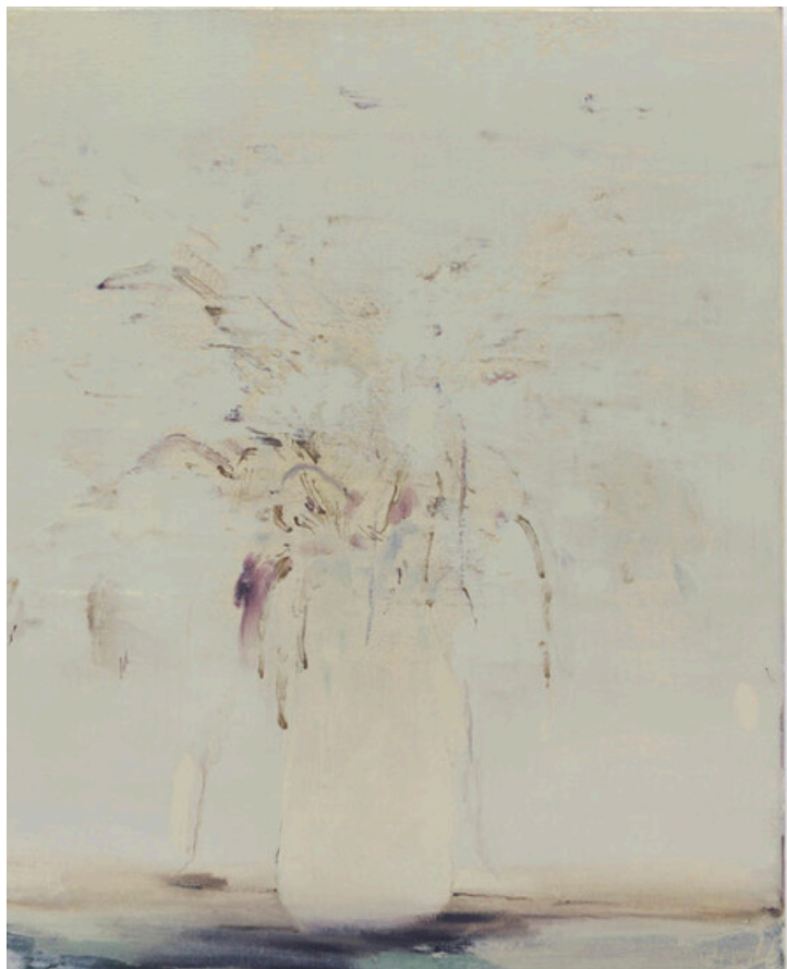
Nazzarena Poli Maramotti, Viole 2022, Mixed media on canvas, 50x40 cm € 2,500 vat. incl.