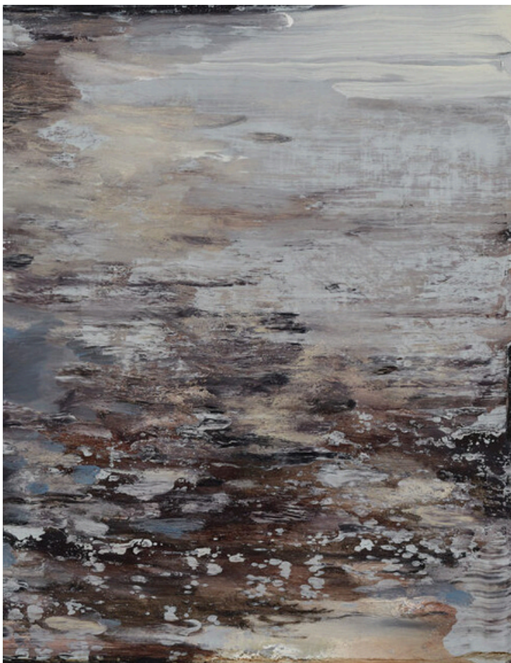
Nazzarena Poli Maramotti, Turbolenze 2024, Mixed media on wood, 30x23x2 cm € 1,600 vat. incl.