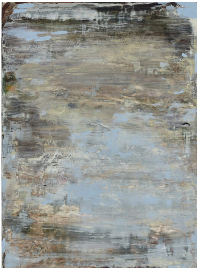
Nazzarena Poli Maramotti, Acque calme 2024, oil on paper, 29x21 cm € 1,400 vat. incl.