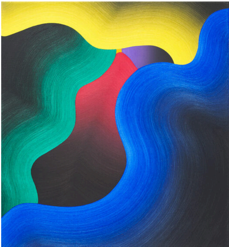
Osamu Kobayashi, Shadow Valley, 2024, oil on canvas, 55x50 cm € 5,000 vat. incl.