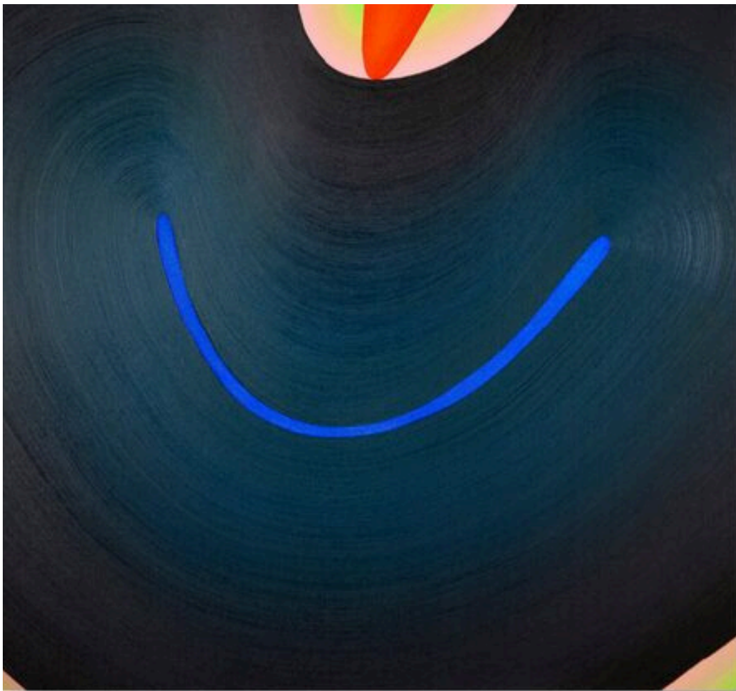
Osamu Kobayashi, Smile IV, 2024, oil on canvas, 76x81 cm € 7,500 vat. incl.