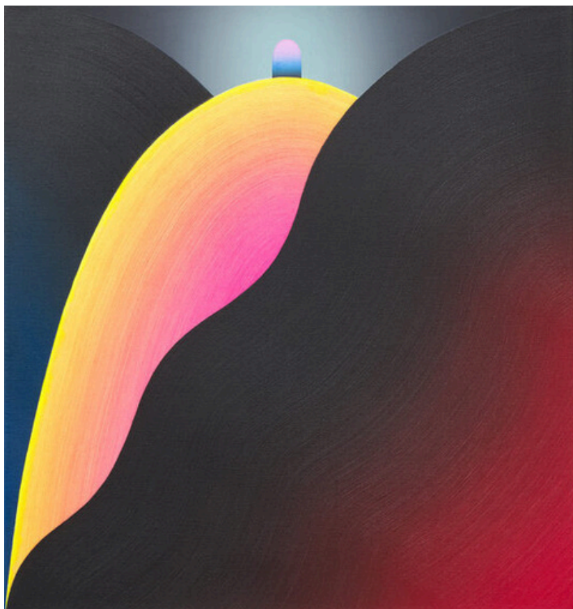
Osamu Kobayashi, Passage, 2023, oil on canvas, 55x50 cm € 5,000 vat. incl.