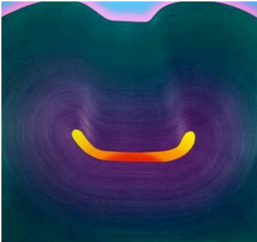
Osamu Kobayashi, Sunset foggy, 2024, oil on canvas, 76x81 cm € 7,500 vat. incl.