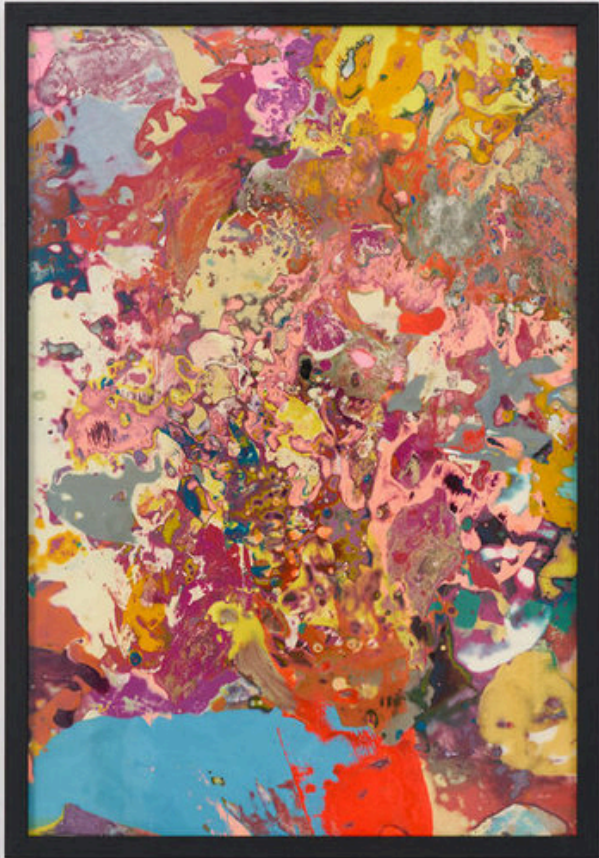
Tiziano Martini Untitled (Il professore della verniciatura) 2023, Two-component polyurethane varnish and coating on paper, mounted on dibond board, framed with museum glass. 70x50 cm € 2,800 vat. incl.