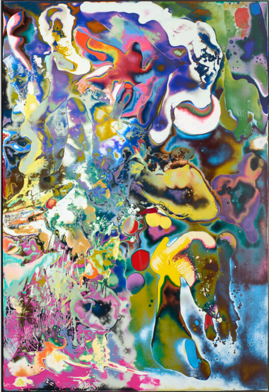
Tiziano Martini Se incoi fosse vendre saria perfetto, cit. 2023, 2 part poliurethan coatings, high solid clear coat over medium density panel 185.5x126 cm € 9,200 vat. incl.