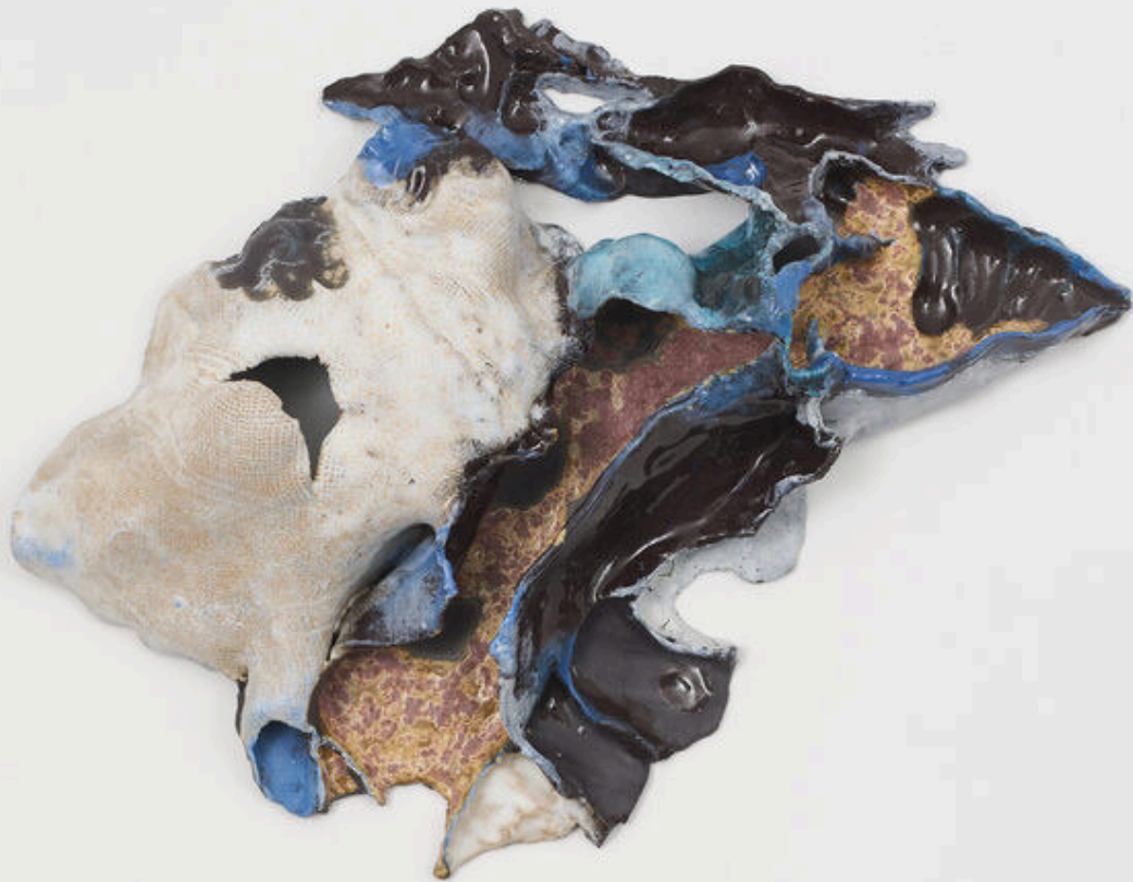
Viola Relle Untitled 2024, porcelain 45x36x10 cm € 2,500 vat. incl.