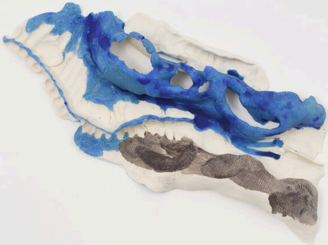
Viola Relle Untitled 2024, porcelain 28x50x6 cm € 2,500 vat. incl.