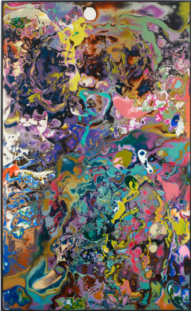
Tiziano Martini La pattuglia anti schivatura 2023, 2 part poliurethan coatings, high solid clear coat over medium density panel 185.5×113 cm € 9,000 vat. incl.