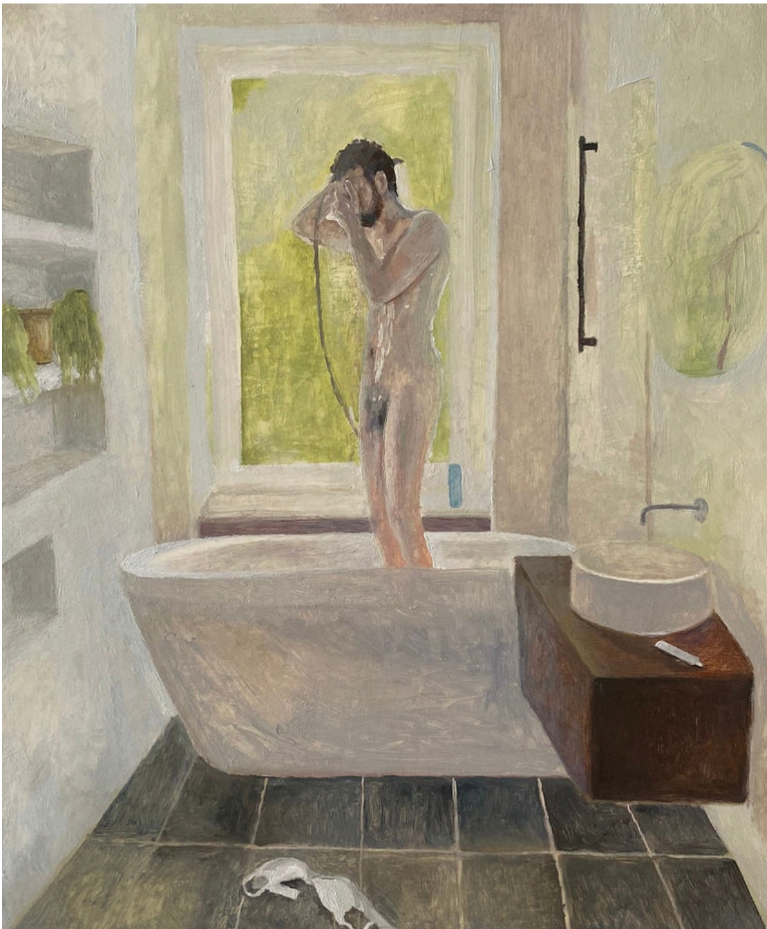
Flora Temnouche Bath time 2024, oil on canvas, 50x60 cm € 2.800 vat. incl.