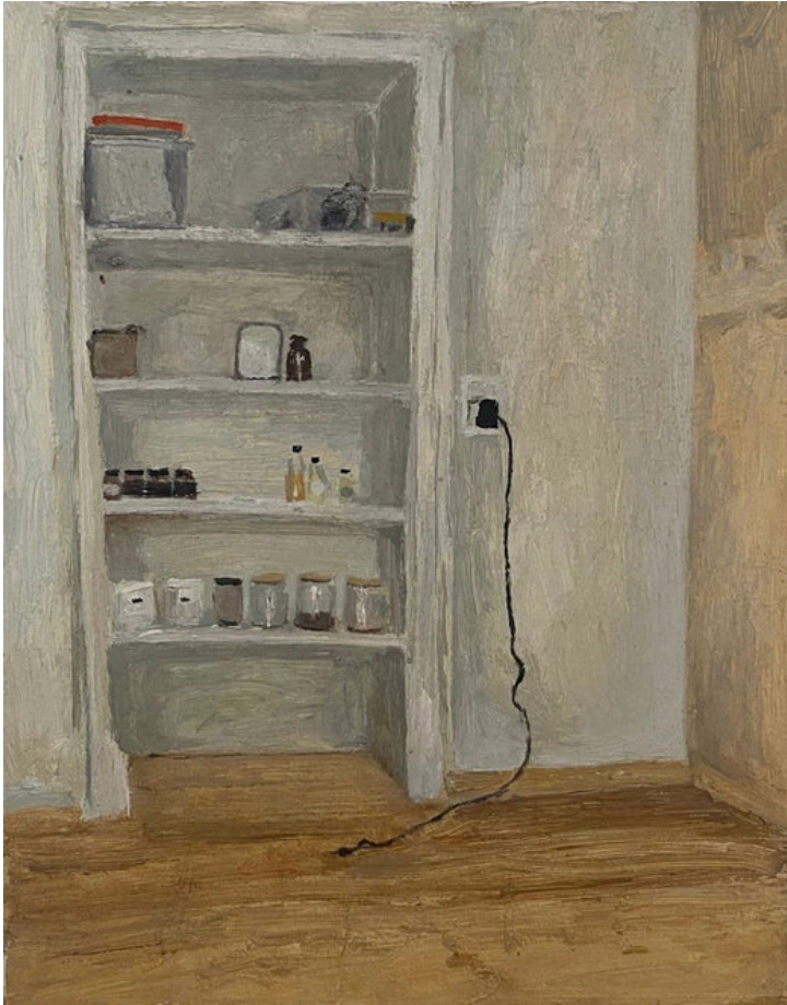
Flora Temnouche Ranger 2024, oil on canvas, 24x18 cm € 1.200 vat. incl.