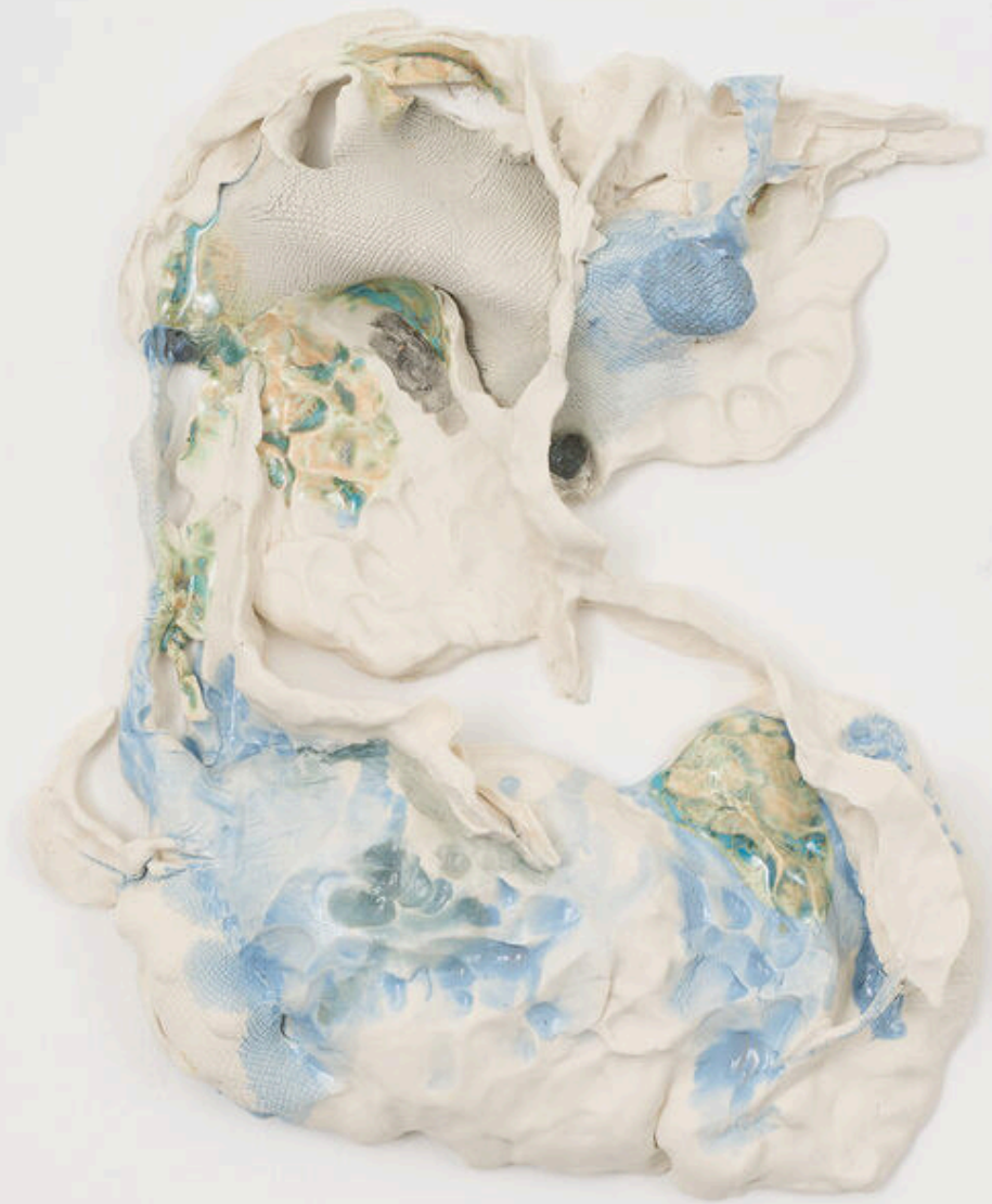
Viola Relle Untitled 2024, porcelain 38x32x6 cm € 2,500 vat. incl.