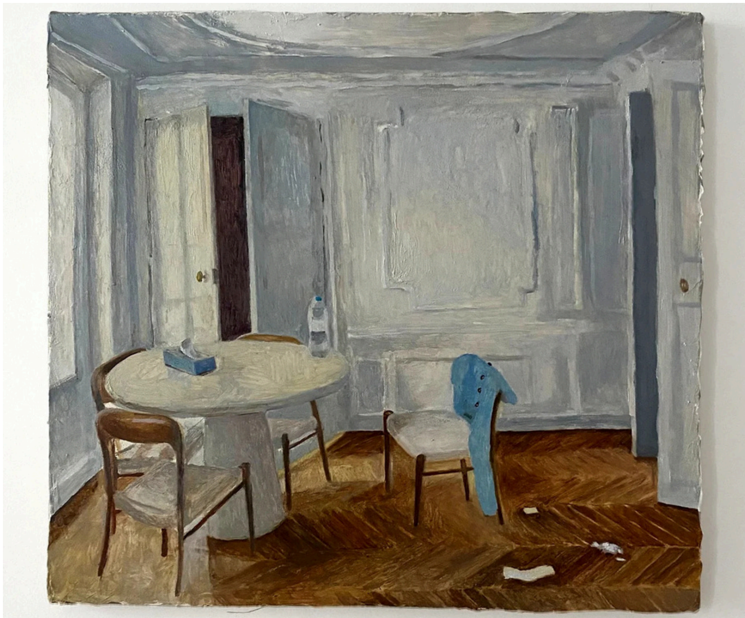
Flora Temnouche Without you, 2024 oil on canvas 48 x 44 cm