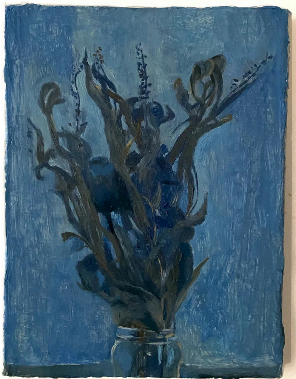
Flora Temnouche Blue Light, 2024, oil on canvas 18 x 25 cm