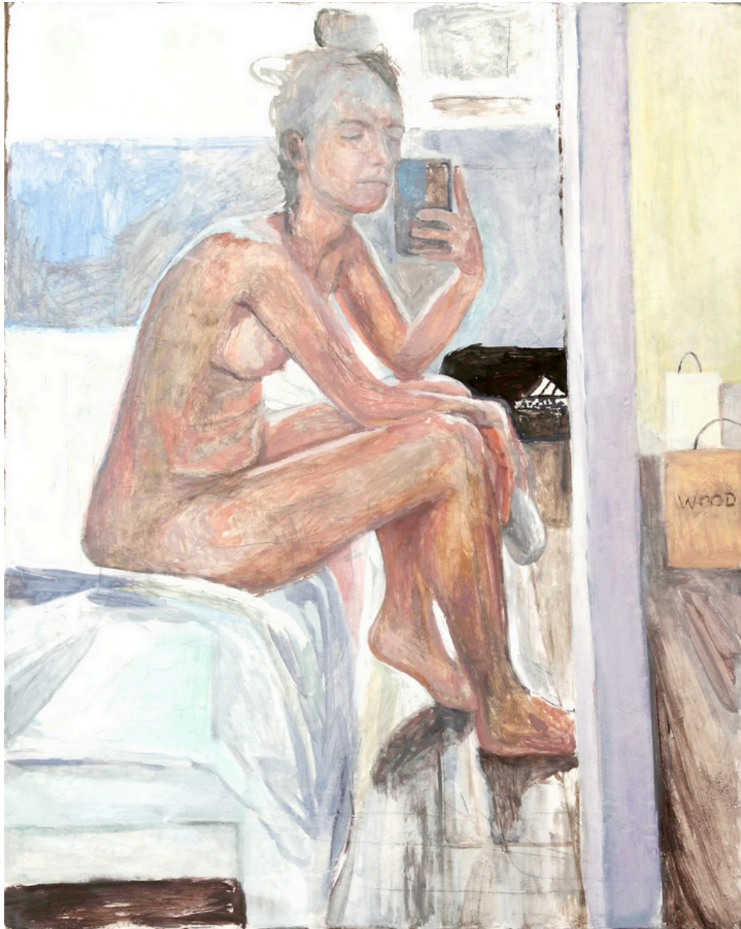
Flora Temnouche After shopping, 2023 oil on canvas 61 x 77 cm