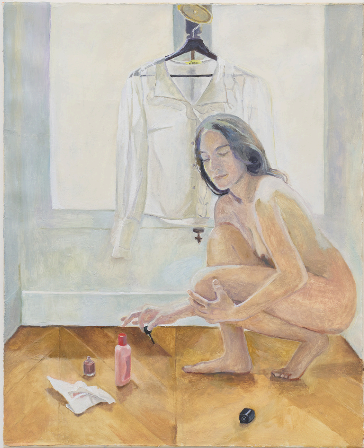
Flora Temnouche Portrait, 2024 oil on canvas 65 x 80 cm