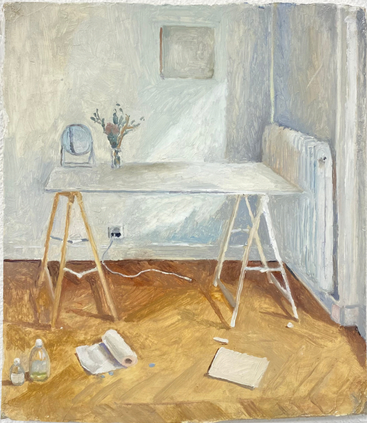
Flora Temnouche Le studio, 2024 oil on canvas 30 x 25 cm