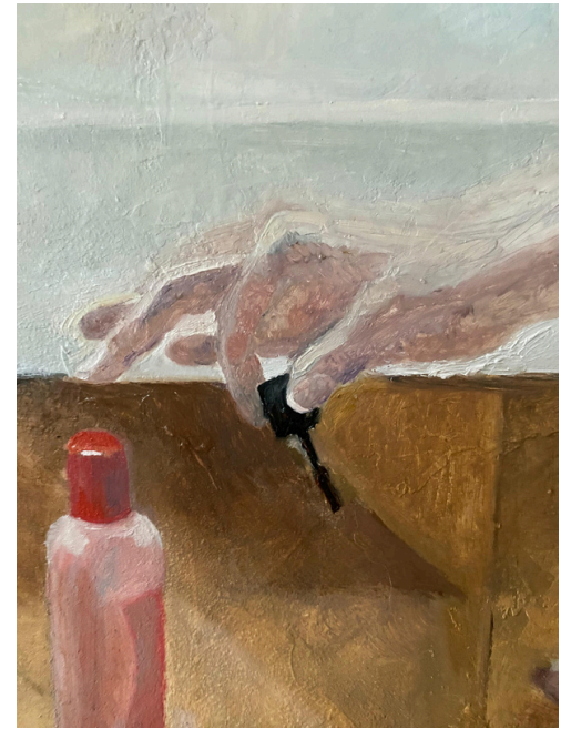
Flora Temnouche Portrait, 2024 oil on canvas 65 x 80 cm