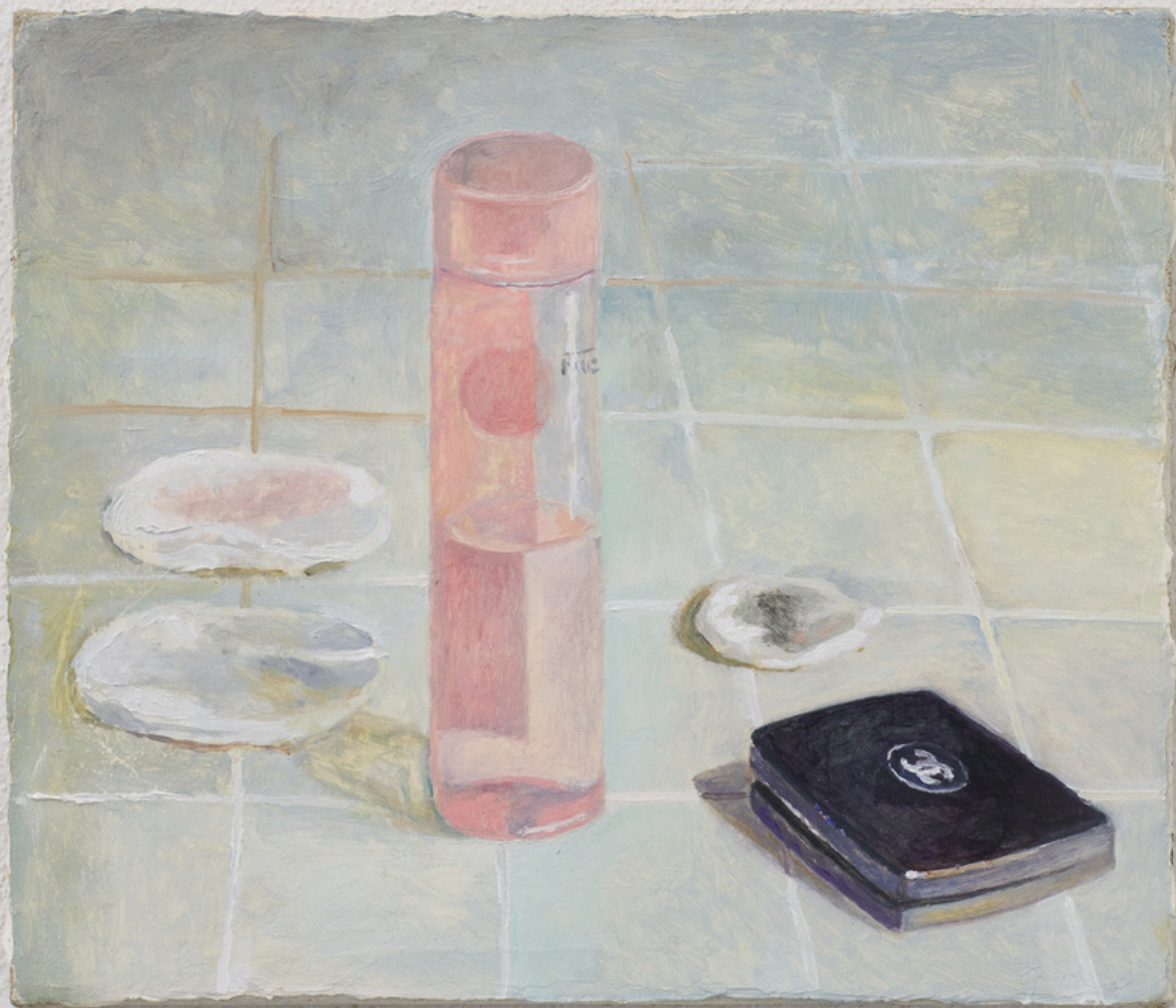
Flora Temnouche Still life, 2024 Oil on canvas 35 x 30 cm